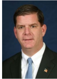
Martin J. Walsh Mayor of Boston

We are fortunate in the City of Boston to have a community that honors our deep ties to history and embraces the opportunity to come together to commemorate the significant milestones we've achieved as a nation. Harborfest is a long standing Boston tradition that brings together thousands of residents and visitors alike, and I am looking forward to another successful celebration this year.