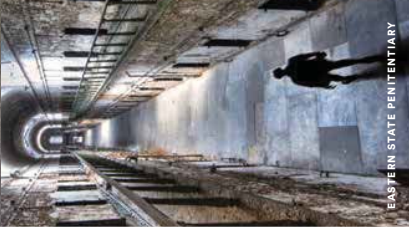
EASTERN STATE PENITENTIARY