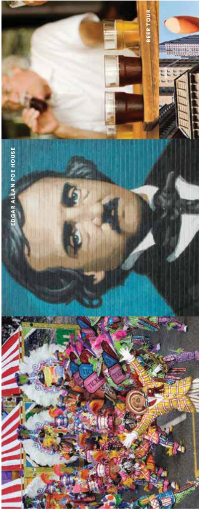
EDGAR ALLAN POE HOUSE