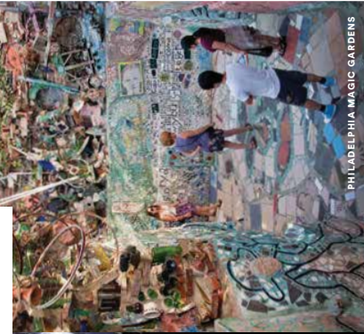
PHILADELPHIA MAGIC GARDENS