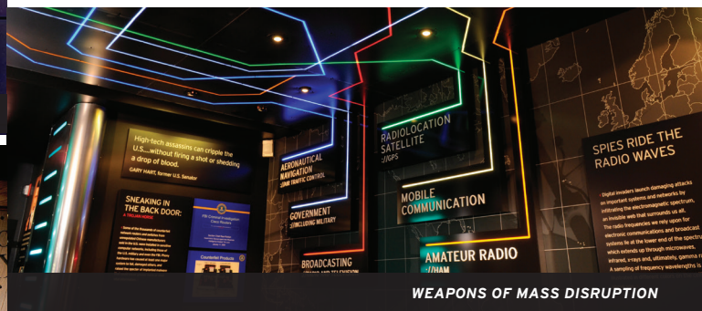
WEAPONS OF MASS DISRUPTION