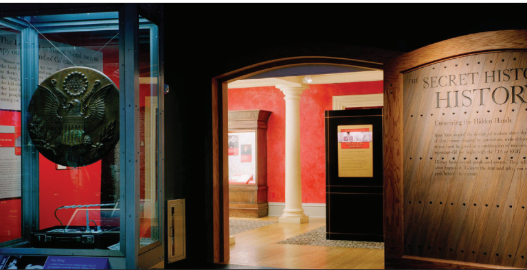
SECRET HISTORY OF HISTORY