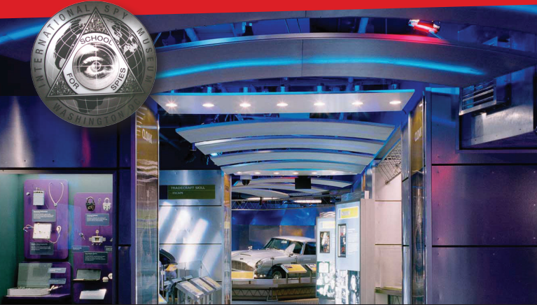
SCHOOL FOR SPIES