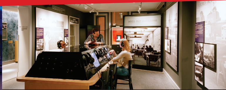
SPIES AMONG US

You know the history. Now you'll know the secret history.