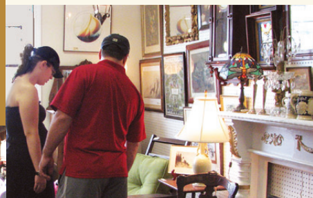
Columbus Farmers Market's South Entrance Buildings 1 and 3

Two huge buildings filled with antiques, crafts, and collectibles!