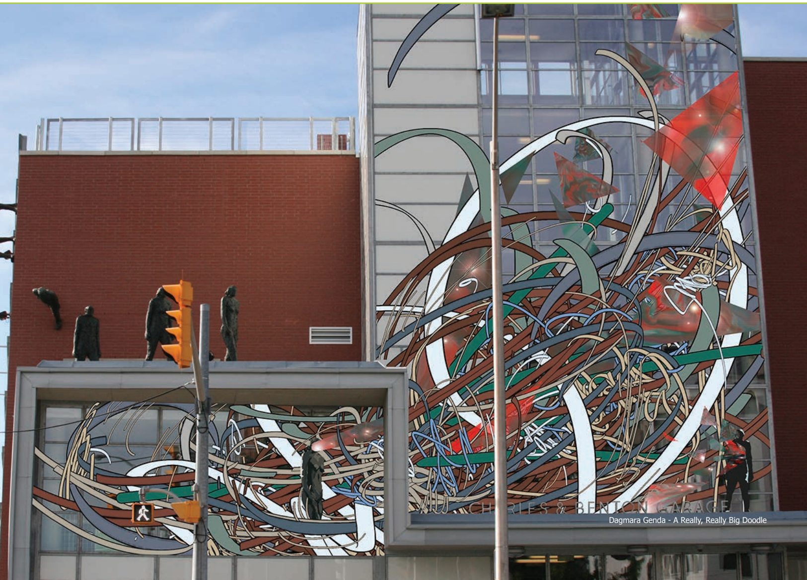
Dagmara Genda - A Really, Really Big Doodle