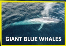
GIANT BLUE WHALES

Newport Beach Close to Anaheim, LAX & LA Over 2800 Whales Viewed in 2016!