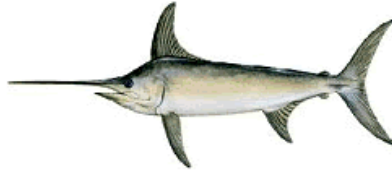
Swordfish Florida Record: 612 lbs., 12 ozs.