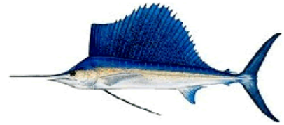
Sailfish Florida Record: 116 lbs.