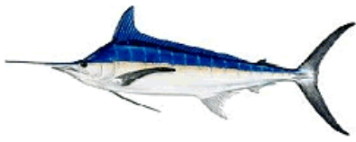
Blue Marlin Florida Record: 980 lbs., 8 ozs.