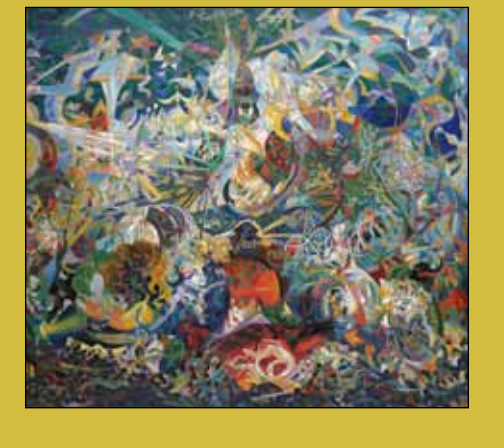
Joseph Stella, Battle of Lights, Coney Island, Mardi Gras , 1913–14, Yale University Art Gallery, New Haven, Connecticut, Gift of Collection Société Anonyme, 1941.689