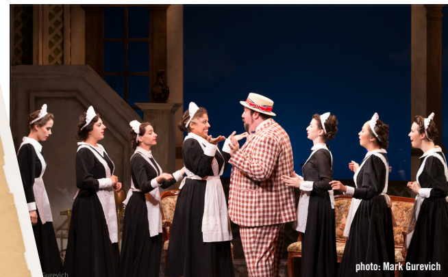
NYTF's 2016 fully-restored production of 1923 operetta The Golden Bride