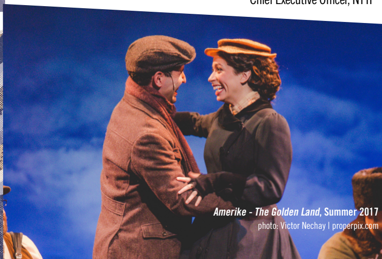
Amerike - The Golden Land, Summer 2017