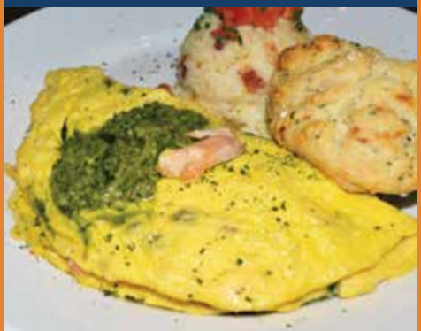
Salmon Spring Greens Omelet - with Grilled Salmon, Capers, Asparagus, Spinach & Lemon Zest, topped with Basil Pesto