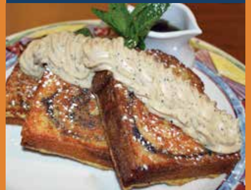
Marble Coffee 'N Cream French Toast - Marble Swirl Chocolate & Vanilla Pound Cake, dipped in French Toast Batter, garnished with Coffee Mascarpone Cream & Powdered Sugar