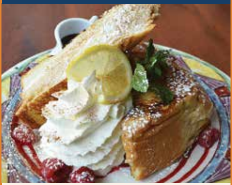
Lemon Ricotta Cheesecake Stuffed French Toast garnished with Fresh Raspberries, Sugared Lemon Wheel, Raspberry Puree Plate Glaze, Whipped Cream, Cinnamon & Powdered Sugar