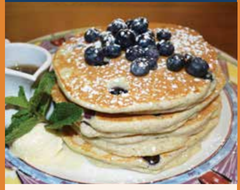
Blueberry Buckwheat Pancakes - Buckwheat & Multigrain Pancakes with Fresh Blueberries, garnished with Powdered Sugar