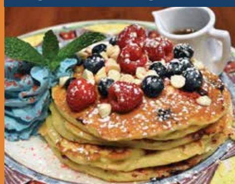
July 4th Fireworks Pancakes with Raspberries, Blueberries & White Chocolate Chips, garnished with Blue Whipped Cream & Strawberry Pop Rocks