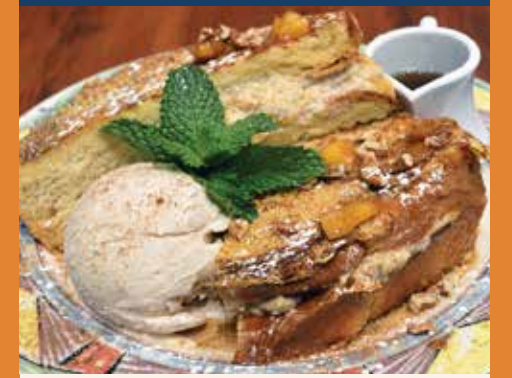
Peach Bourbon Pecan Cheesecake Stuffed French Toast garnished with Brown Sugar Sautéed Peaches, Cinnamon Danish Sauce, Graham Cracker Crumbs & Powdered Sugar, served with scoop of Prigel Family Creamery Cinnamon Ice Cream