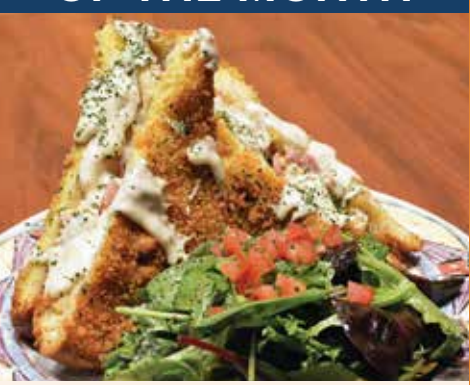
Chicken Cordon Bleu Stuffed French Toast with Applewood-Smoked Country Ham, Grilled Chicken, Swiss Cheese & Béchamel Sauce, encrusted with Seasoned Panko breading & fried