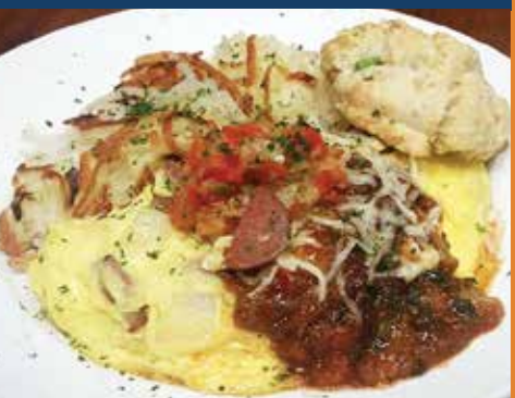
Chili Dog Omelet with Diced Kosher All-Beef Hot Dog, Vidalia Onions & Cheddar Cheese, topped with Beef Chili & Pickle Peppadew Relish