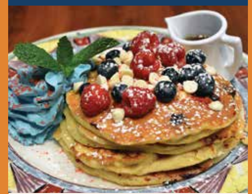
July 4th Fireworks Pancakes with Raspberries, Blueberries & White Chocolate Chips, garnished with Blue Whipped Cream & Strawberry Pop Rocks