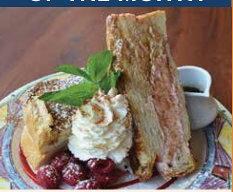
Lemon Raspberry Cheesecake Stuffed French Toast garnished with Raspberry Purée Plate Glaze, Fresh Raspberries, Whipped Cream, Cinnamon & Powdered Sugar