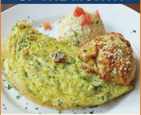
Green Eggs & Ham Omelet with Diced Country Ham & White Cheddar Cheese inside a Spinach & Herb Omelet