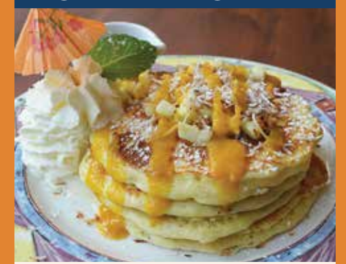
Tropical Pineapple Mango Coconut Pancakes with Diced Pineapple, Mango & Shredded Coconut, garnished with Mango Purée, Whipped Cream, Powdered Sugar & Tiki Umbrella Pick