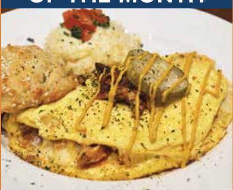
Cuban Omelet with BBQ Pulled Chicken, Swiss Cheese & Diced Country Ham, garnished with Pickle & Creole Mustard