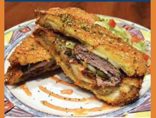
Bacon Cheeseburger Stuffed French Toast filled with Roseda Ground Beef, Applewood-Smoked Bacon, White Cheddar Cheese, Pickles & Vidalia Onions, breaded in Sesame Seeds & Panko Breadcrumbs, fried and garnished with Lettuce, Diced Tomato & Special Sauce