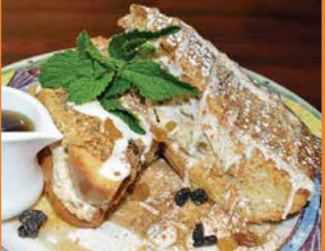
Oatmeal Raisin Pecan Cheesecake Stuffed French Toast garnished with Cinnamon

garnished with Cinnamon Danish Sauce, Cream Cheese Icing, Raisins, Cinnamon & Powdered Sugar