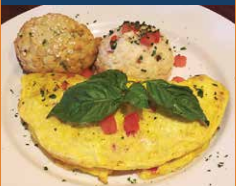
Margherita Omelet with Fresh Mozzarella, Basil & Diced Tomatoes