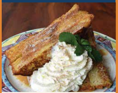
Churro Cheesecake Stuffed French Toast garnished with Dulce de Leche, Cinnamon, Sugar, Whipped Cream & Powdered Sugar