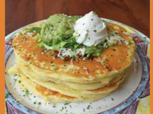
Taco Pancakes with Seasoned Ground Beef, Shredded Cheddar & Diced Tomato, garnished with Shredded Lettuce, Sour Cream & Avocado Mash