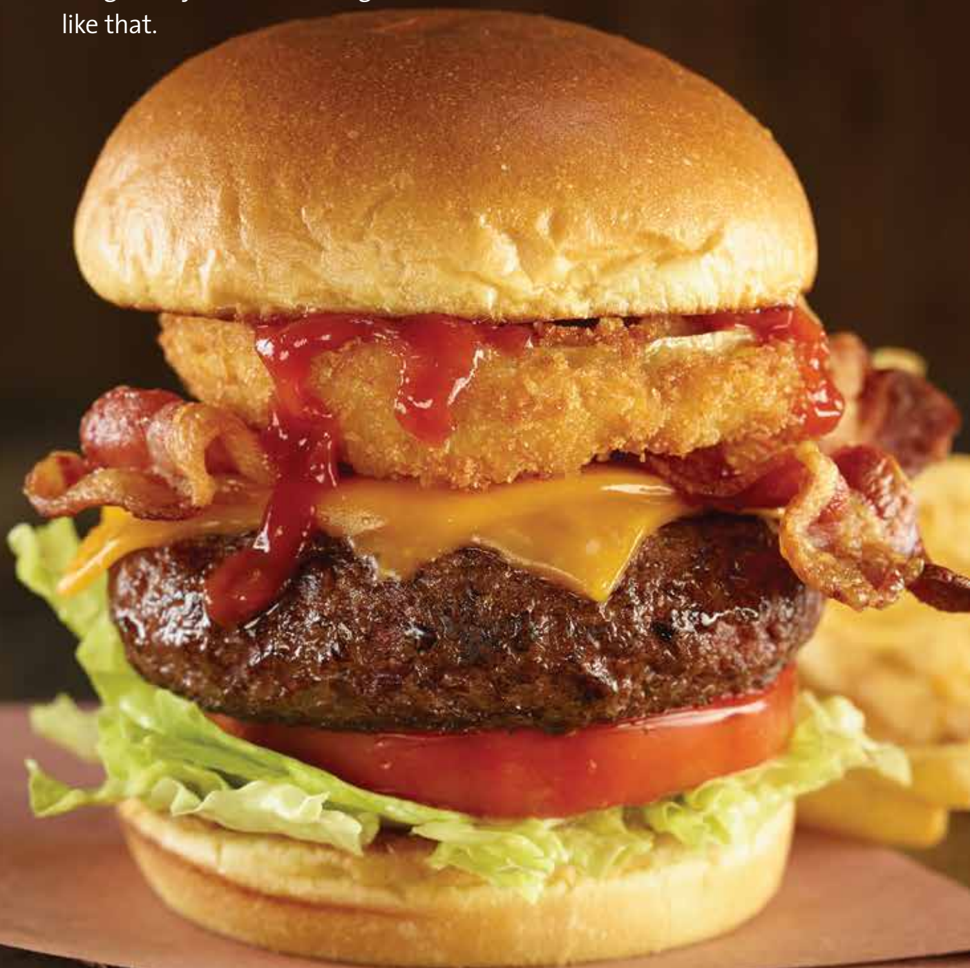
ORIGINAL LEGENDARY® BURGER