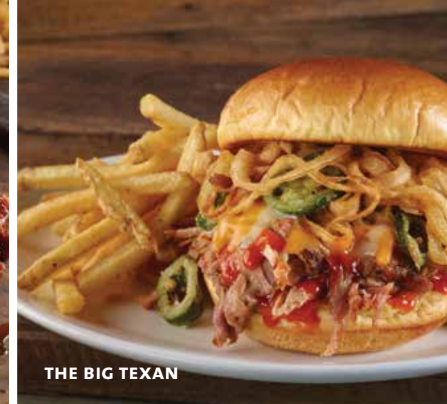
THE BIG TEXAN