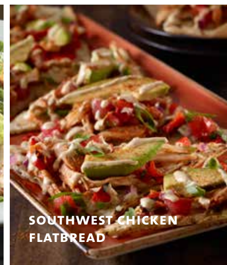
SOUTHWEST CHICKEN FLATBREAD