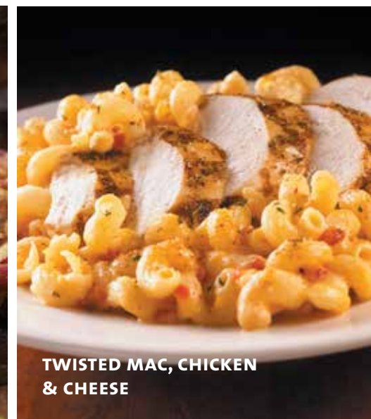
TWISTED MAC, CHICKEN & CHEESE

* Consuming raw or undercooked hamburgers, meats, poultry, seafood, shellfish or eggs may increase your risk of foodborne illness, especially if you have certain medical conditions.