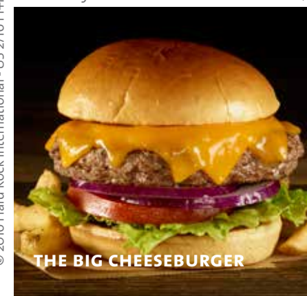
THE BIG CHEESEBURGER

© 2016 Hard Rock International - US 2/16 FR+FLAT AT