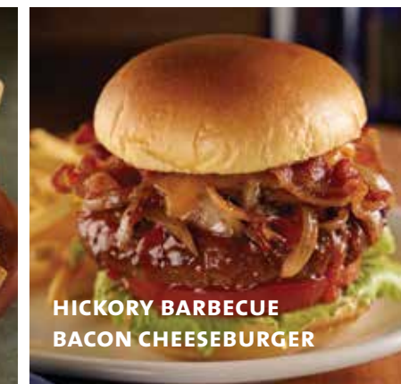
HICKORY BARBECUE BACON CHEESEBURGER

†Contains nuts or seeds. *Consuming raw or undercooked hamburgers, meats, poultry, seafood, shellfish or eggs may increase your risk of foodborne illness, especially if you have certain medical conditions.