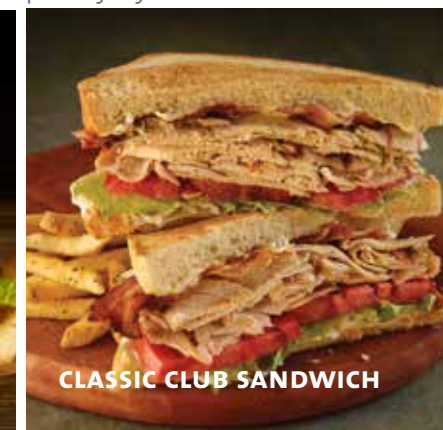
CLASSIC CLUB SANDWICH