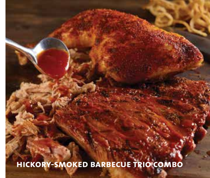
HICKORY-SMOKED BARBECUE TRIO COMBO