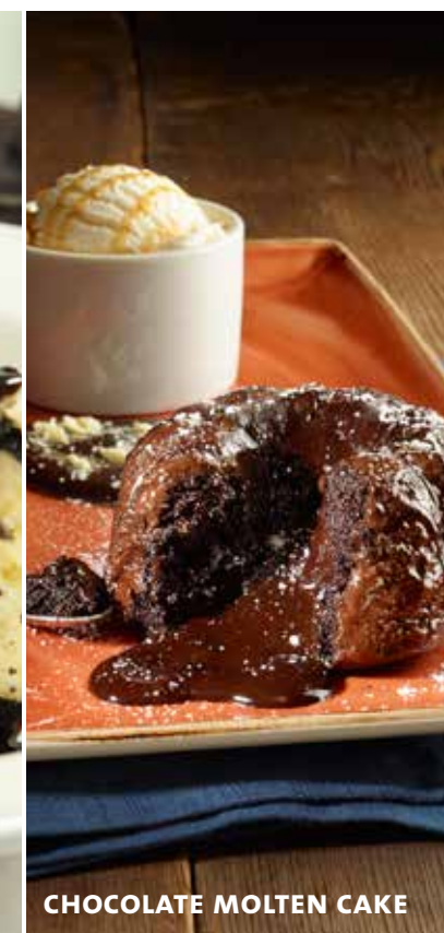
CHOCOLATE MOLTEN CAKE