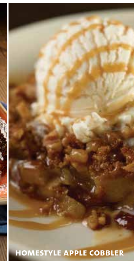
HOMESTYLE APPLE COBBLER