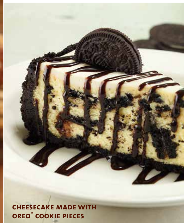
CHEESECAKE MADE WITH OREO® COOKIE PIECES