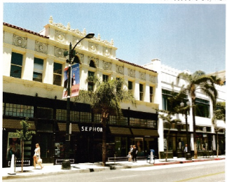
Many buildings in Old Pasadena reflect Spanish Colonial Revival Architecture.