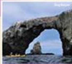
Channel Islands National Park

Channel Islands National Park and National Marine Sanctuary encompasses five remarkable islands and their ocean environment. Boating, whale watching, kayaking and hiking adventures to the area are available through outfitter locations in both the Channel Islands Harbor and Ventura Harbor Village.