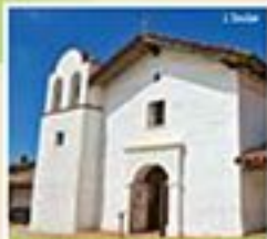
El Presidio de Santa Bárbara

El Presidio de Santa Bárbara State Historic Park is surrounded by modern day downtown Santa Barbara and is a unique step back in time. Built by the Spanish in 1782, it was the last of four military fortresses built along the coast of Alta California. Open daily - tours available.