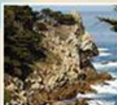
Point Lobos State Reserve

At Point Lobos State Reserve you will encounter the most dramatic meeting of land and sea along Highway 1. Continue to be awe-struck at the spires and caves of Pinnacles National Park . It is true, Monterey County parks inspire and invigorate the soul.