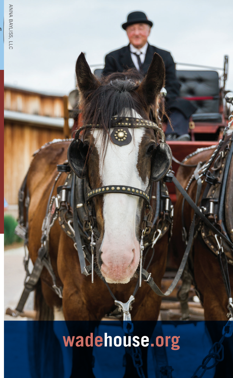
ANNA BAVLISS, LLC