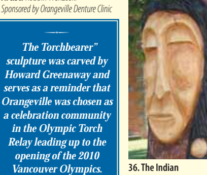
36. The Indian 259 Broadway Artist: Jeff Waters