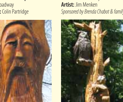
53. Woodland Creatures Greenwood Cemetery Artist: Jim Menken