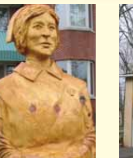
25. The Nurse 32 First Street Artist: Jim Menken Background: The Nurse marked the IODE's 100th anniversary in 2007, and sits in front of the former hospital. ponsored by the IODE