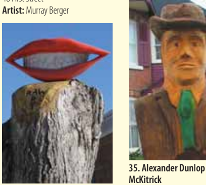
32. The Smile 33 First Street Artist: Robbin Wenzoski