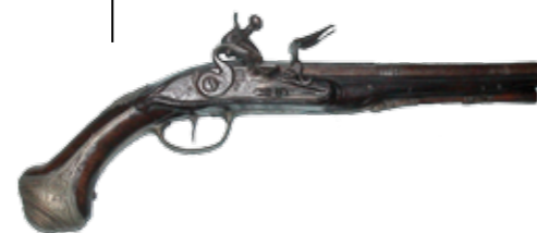
Santa Anna's Captured Sash Pistol - Along with his uniform, sword and other military items, Santa Anna's sash pistol was captured by Texian forces at the Battle of San Jacinto.