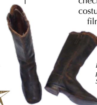
Sam Houston's Boots - Boots, spurs, and other personal effects of the great Sam Houston are on display.