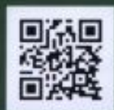
Café Burnside Restaurant Menu