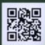
Latil's Landing Restaurant Menu