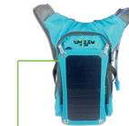
e-Backpack with solar panel