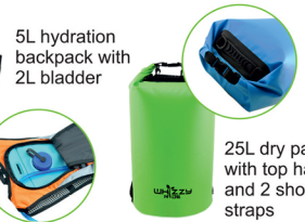
5L hydration backpack with 2L bladder