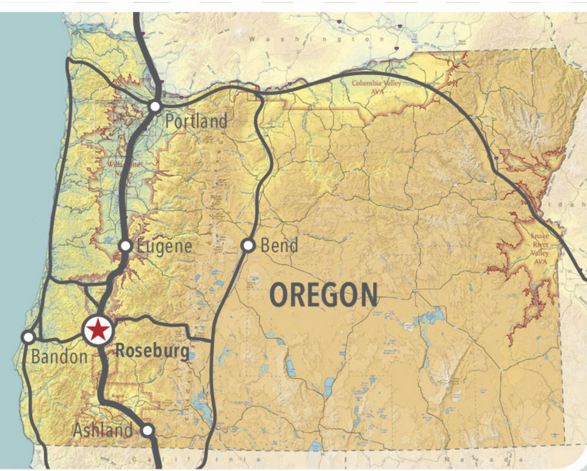
The Maps Store, Inc., "Map of State of Oregon American Viticultural Areas" (2008). Oregon Wine Board AVA Maps. Image. Submission 7.