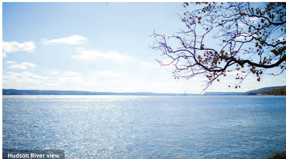
Hudson River view

Playground, walking paths, lighted ballfields, basketball courts, picnic facilities. Open dawn to dusk.