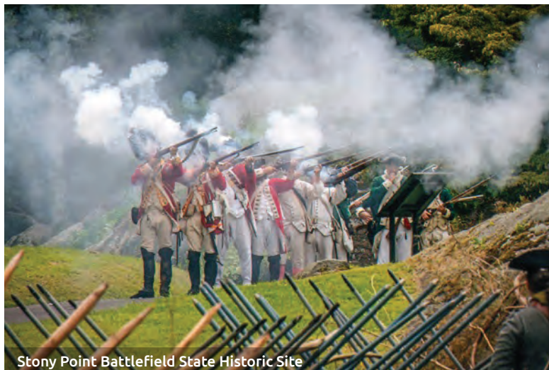
Stony Point Battlefield State Historic Site