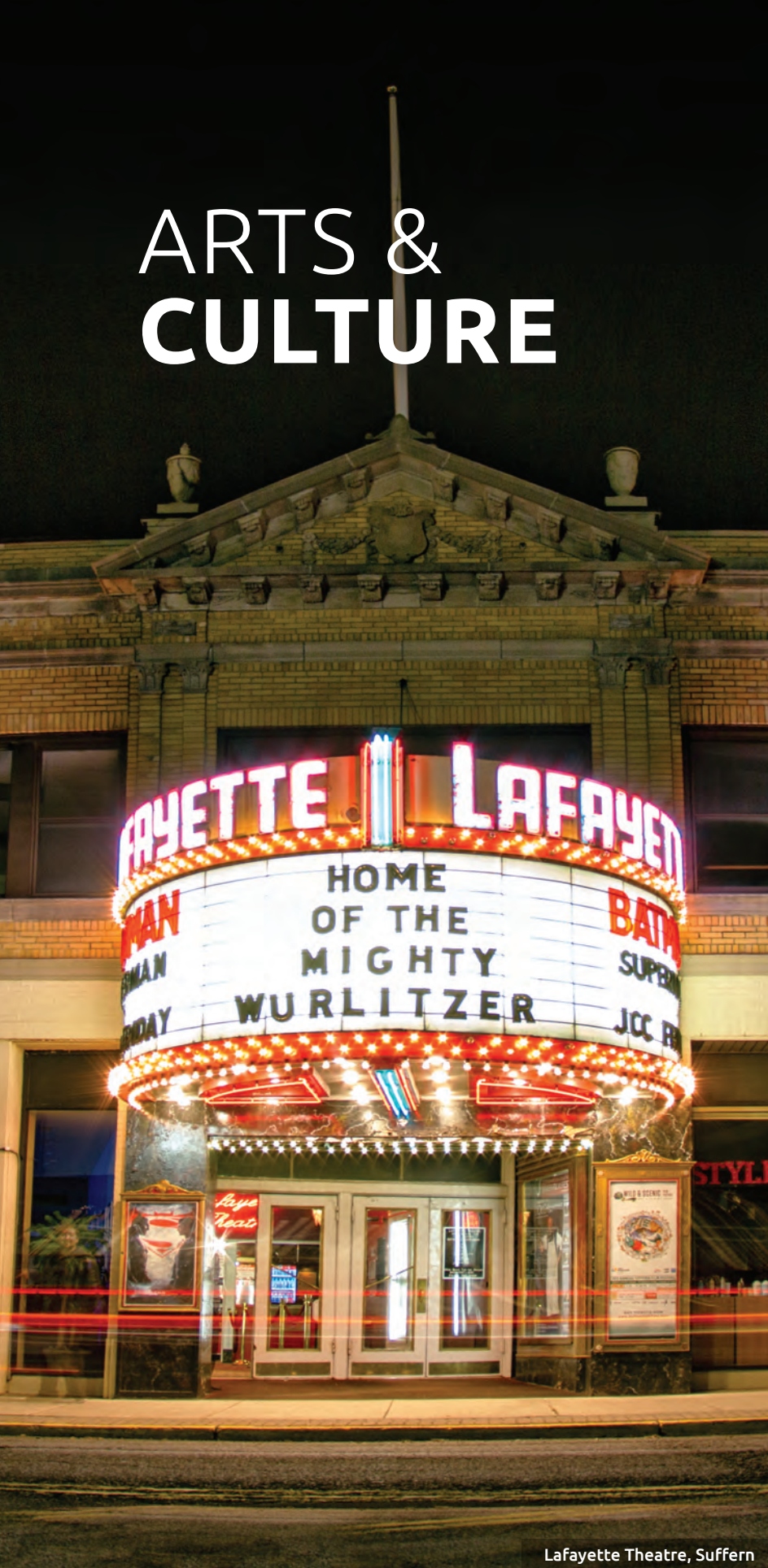
Lafayette Theatre, Suffern

I ts many theaters, music, dance and arts group represent Rockland's diverse culture, expansive talent and artistic center.