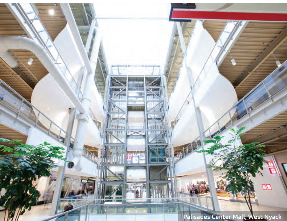
Palisades Center Mall, West Nyack

I n addition to all the other exciting attractions listed in this guide, Rockland County is home to some unique special attractions, including one of the country's largest indoor malls, the Palisades Center, and the newly redesigned, upscale shopping establishment right in the heart of the county, the Shops at Nanuet. Situated on the grounds of a historic 19th-century country estate, Torne Valley Vineyards in Hillburn offers wine tastings and live music on the weekends, as well as tremendous views of the Ramapo River.