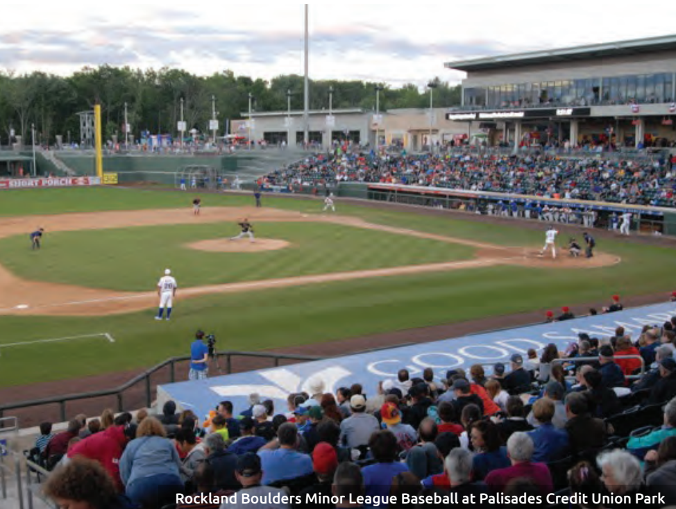
Rockland Boulders Minor League Baseball at Palisades Credit Union Park