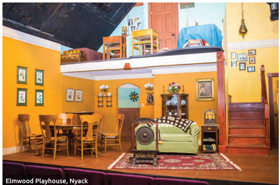
Elmwood Playhouse, Nyack

Rockland's only historic single-screen, 1,000-seat movie palace, built in 1923. Featuring its original Wurlitzer theater organ, the Lafayette screens first-run films, and specialty programs.