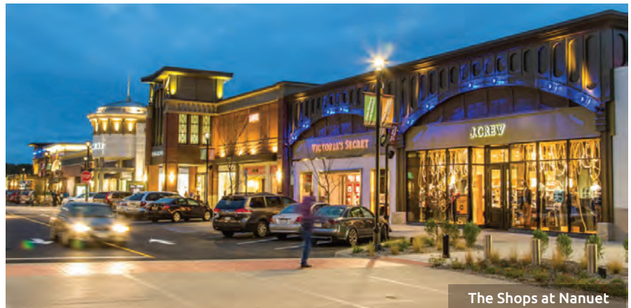
The Shops at Nanuet

The world’s tallest indoor ropes course. Our ropes course stands 85 feet tall and