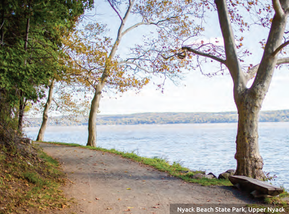
Nyack Beach State Park, Upper Nyack