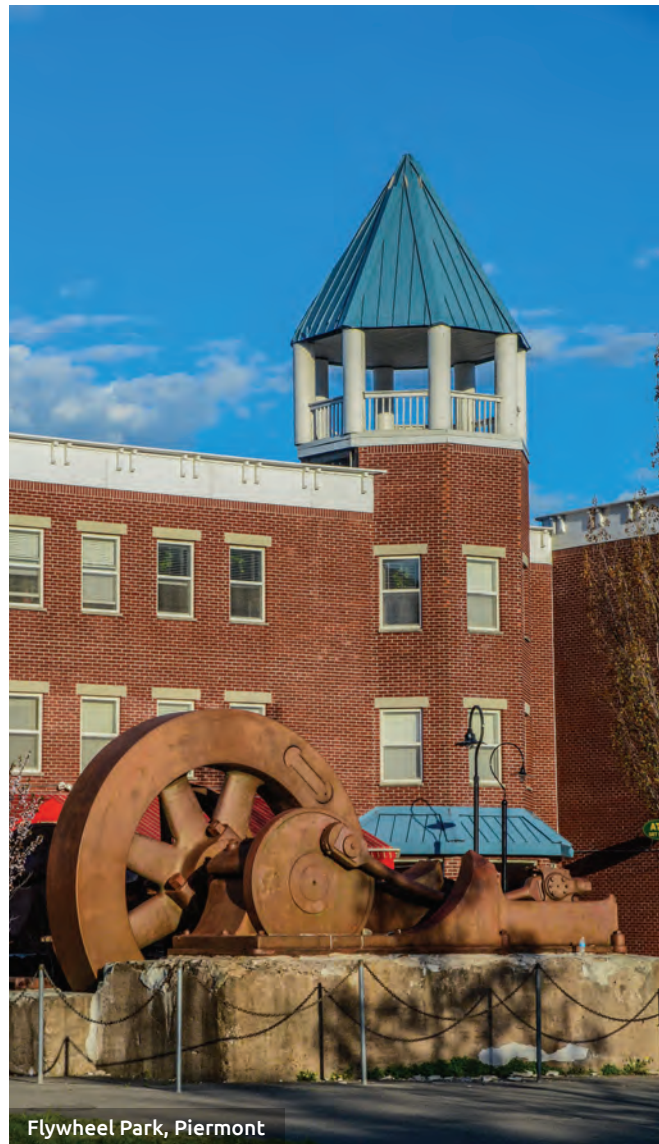
Flywheel Park, Piermont