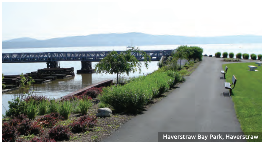
Haverstraw Bay Park, Haverstraw

Completely renovated in 2006. A peaceful, lovely oasis in the middle of the bustling