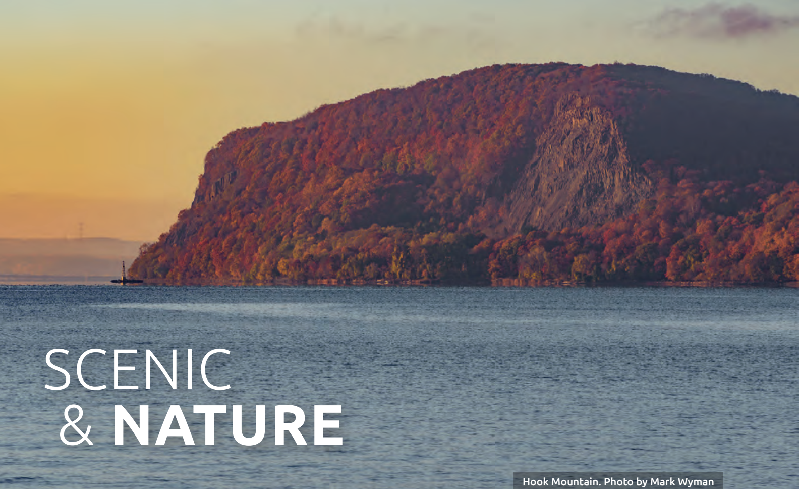
Hook Mountain.