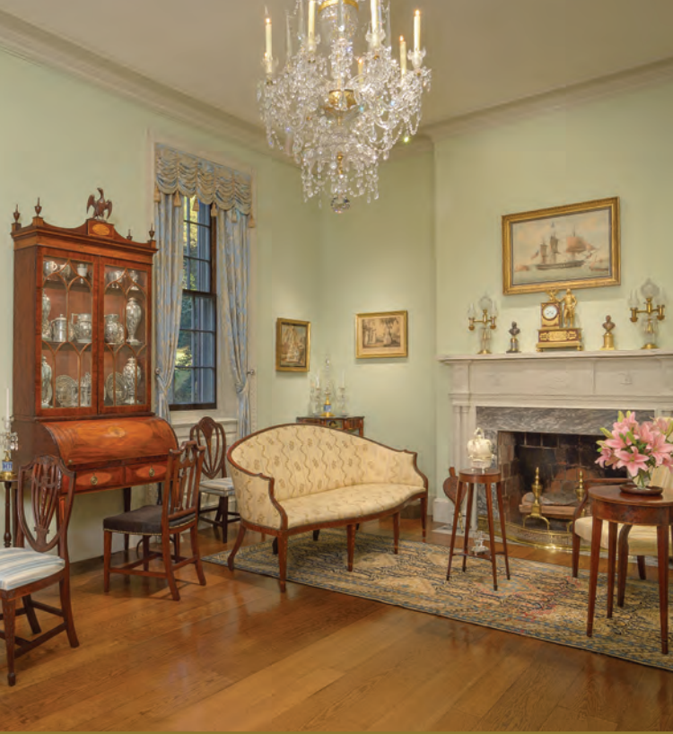
Breathtaking Beauty • Extraordinary Stories