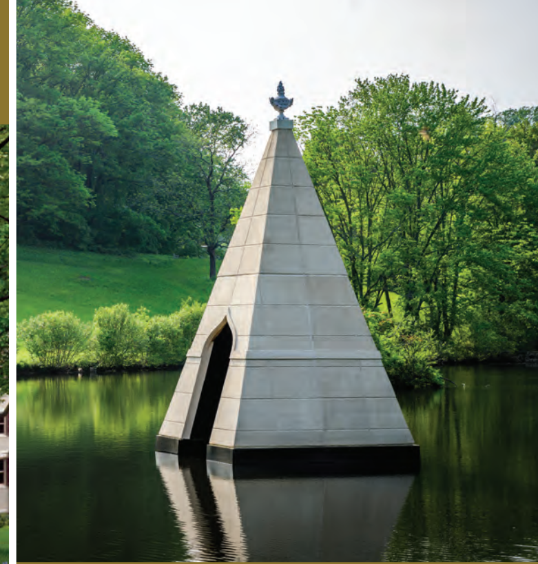
Spectacular Treasures • An American Vision