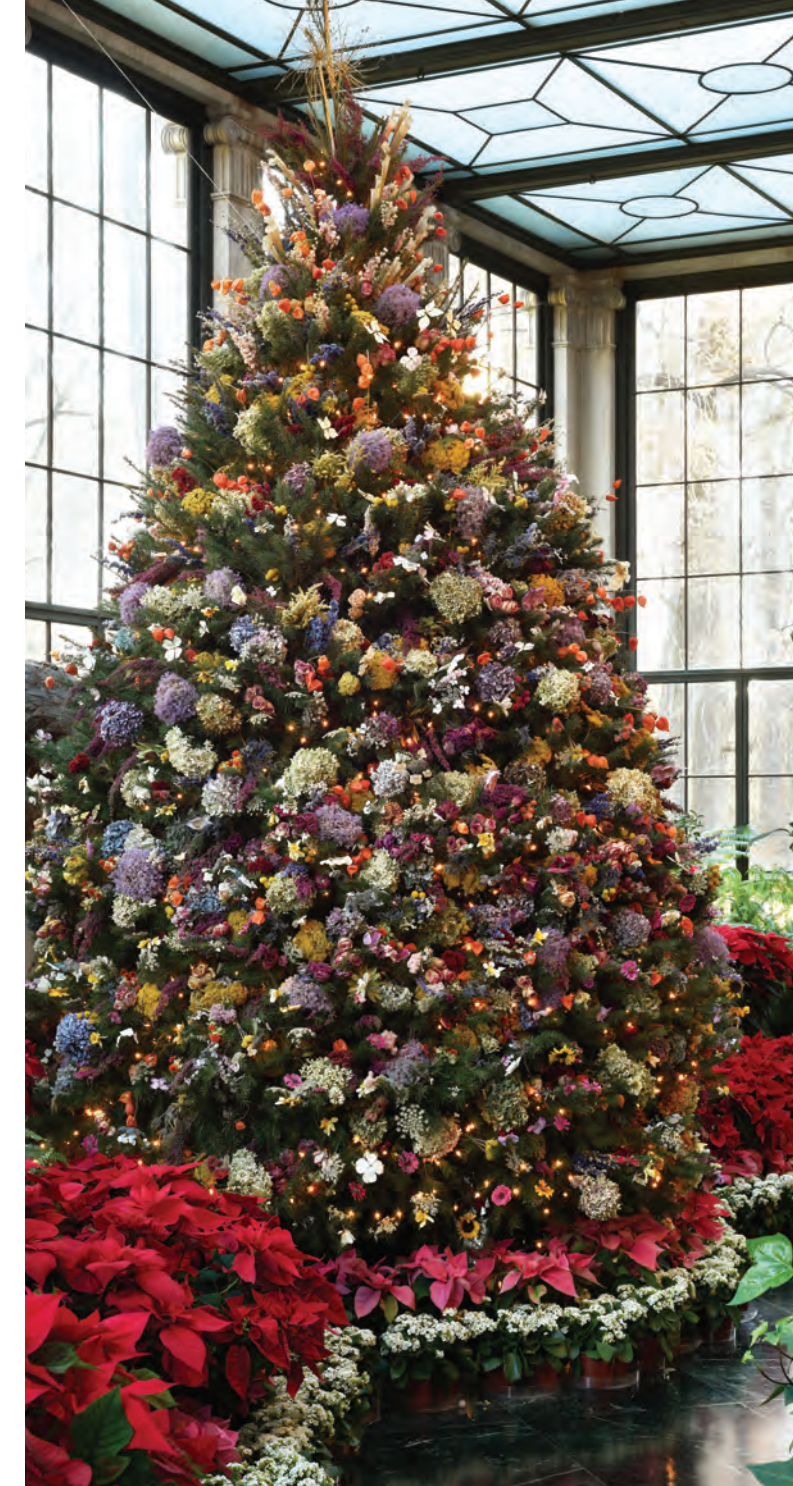
Cover: Winterthur, house and conservatory, from the March Bank. Inside folds, clockwise from top left: Needle’s Eye Folly, Baltimore Drawing Room; Enchanted Woods, John Trumbull, Washington at Verplanck’s Point, 1790. Gift of Henry Francis du Pont. Inside, left: Painting of Henry Francis du Pont by Ellen Emmet Rand, 1914. Bequest of Henry Francis du Pont; inside, center: Latimeria Summerhouse Folly in the Peony Garden, inside, right: Yuletide at Winterthur’s famous dried-flower tree.

“The story of Winterthur tells the greatest story of our time, the story of the American people.”