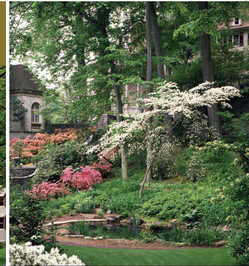
Discover Winterthur’s Treasures