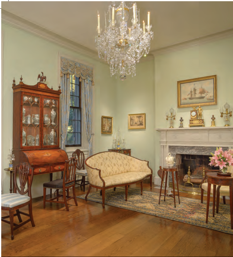
—Spectacular Inside and Out!