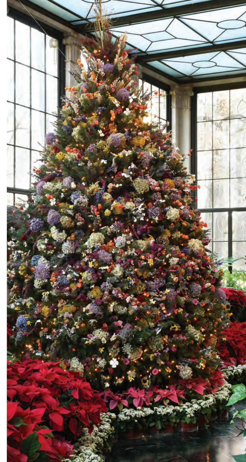
Cover: Winterthur, house and conservatory, from the March Bank. Inside folds, clockwise from top left: Glade Garden, Baltimore Drawing Room; Enchanted Woods, John Trumbull, Washington at Verplanck’s Point, 1790. Gift of Henry Francis du Pont. Inside, left: Painting of Henry Francis du Pont by Ellen Emmet Rand, 1914. Bequest of Henry Francis du Pont; inside, center: Peony Garden, inside, right: Yuletide at Winterthur’s famous dried-flower tree.