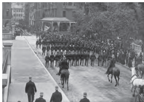
Ancient and Honorable Artillery Co. State House, June Day 1900

Since 1880 the AHAC has been the sole occupant of the fourth floor of this historic building after originally being located in the 1659 Town House, built through the generosity of Robert Keayne, the first commander of the Company.