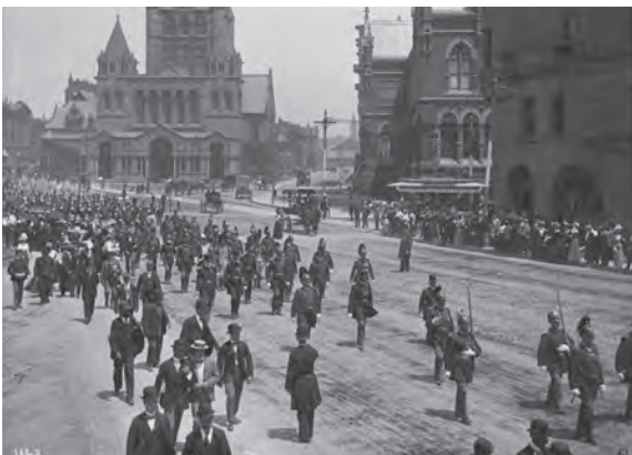
Ancient and Honorable Artillery Co. Copley Square, 1899

Individuals interested in becoming members of the AHAC should contact the Executive Secretary at 617-227-1638 during weekday business hours.