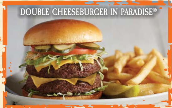
DOUBLE CHEESEBURGER IN PARADISE®

Shredded iceberg lettuce, seasoned ground beef, cheddar and Monterey Jack cheese, diced tomatoes, black beans, diced cucumbers, roasted corn and avocado tossed in ranch dressing, topped with crispy tortilla strips, queso fresco and cilantro. Served with fresh guacamole and sour cream (1330 calories)