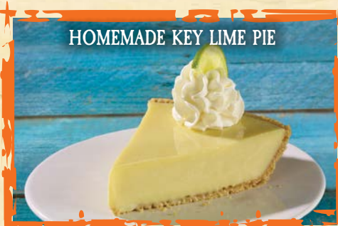
HOMEMADE KEY LIME PIE

Our signature key lime pie made from scratch daily (get yours while they last!) (580 calories)