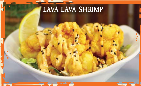
LAVA LAVA SHRIMP

Hand-breaded dill pickle chips, served with our ranch dipping sauce (680 calories)