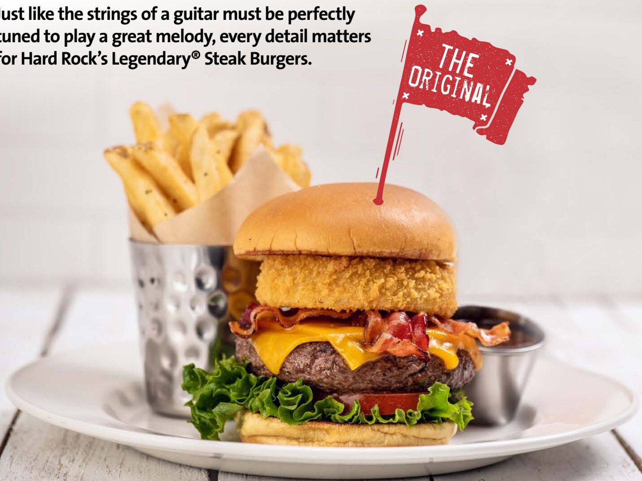
ORIGINAL LEGENDARY® BURGER

Just like the strings of a guitar must be perfectly tuned to play a great melody, every detail matters for Hard Rock's Legendary® Steak Burgers.