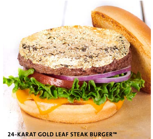
24-KARAT GOLD LEAF STEAK BURGER™