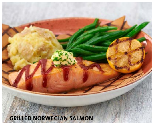
GRILLED NORWEGIAN SALMON

8oz cedar-wrapped grilled salmon with herb butter and house-made barbecue sauce, served with Yukon Gold mashed potatoes and fresh vegetables.*