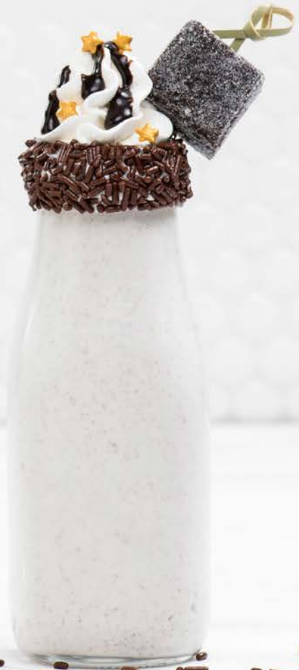
COOKIES & CREAM MILKSHAKE