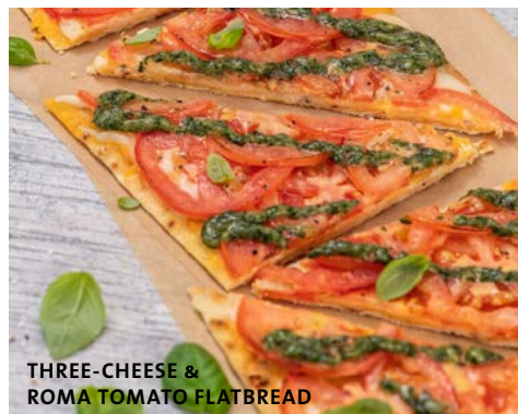
THREE-CHEESE & ROMA TOMATO FLATBREAD

Crispy spring rolls with black beans, roasted corn, Monterey Jack cheese, red peppers and jalapeños with a guacamole ranch dipping sauce.