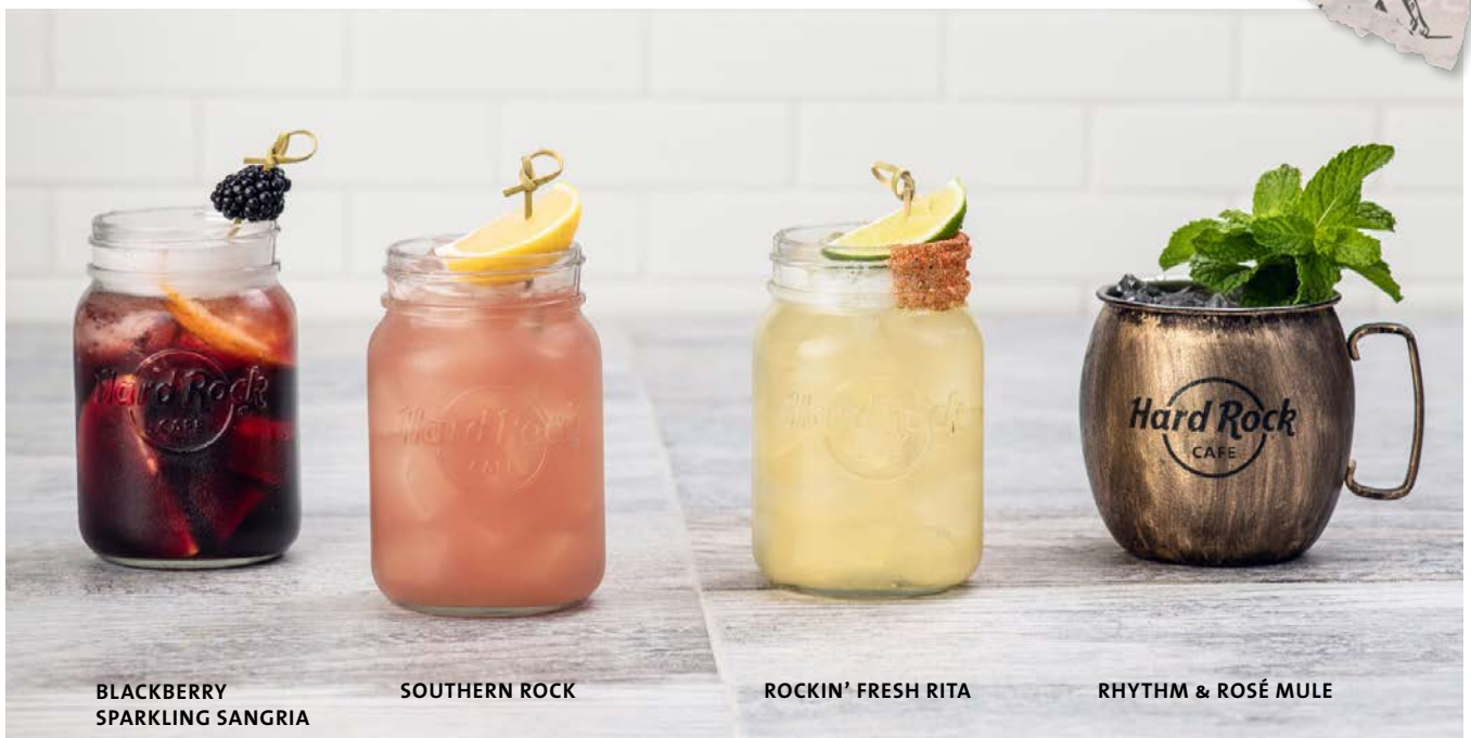
BLACKBERRY SPARKLING SANGRIA