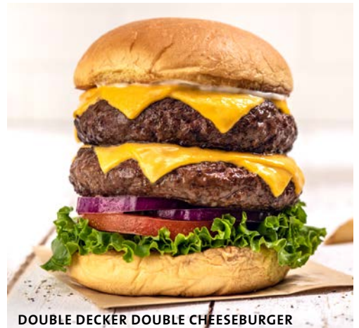
DOUBLE DECKER DOUBLE CHEESEBURGER

We hold allergy information for all menu items, please speak to your server for further details. If you suffer from a food allergy, please ensure that your server is aware at the time of order. † Contains nuts or seeds. * These items contain (or may contain) raw or undercooked ingredients. Consuming raw or undercooked hamburgers, meats, poultry, seafood, shellfish or eggs may increase your risk of foodborne illness, especially if you have certain medical conditions. 2000 calories a day is used for general nutrition advice, but calorie needs vary. Additional nutritional information is available upon request.