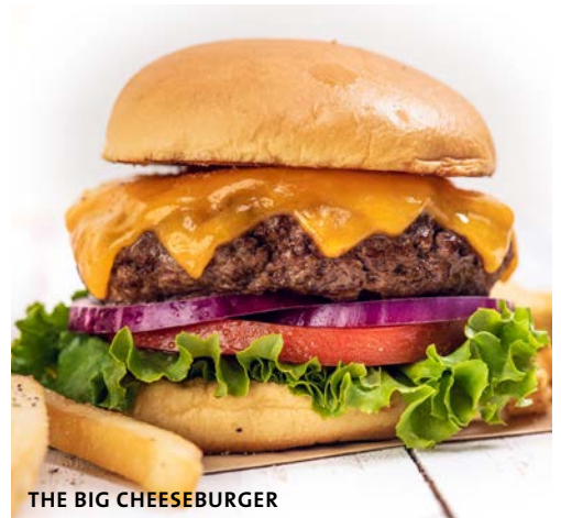
THE BIG CHEESEBURGER