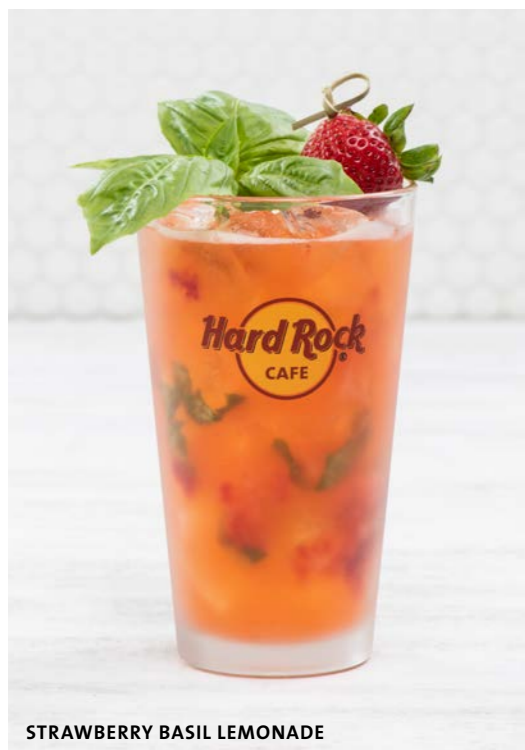
STRAWBERRY BASIL LEMONADE

Hand-muddled pineapple shaken with a refreshing bubbly lemonade, finished with a grilled pineapple slice.