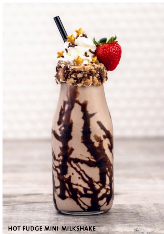
HOT FUDGE MINI-MILKSHAKE

Please note: This item does contain nuts.