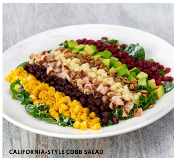
CALIFORNIA-STYLE COBB SALAD

Grilled fresh chicken, avocado, roasted corn, black beans, Monterey Jack cheese, pomegranate seeds, and toasted pepitas on a bed of fresh mixed greens tossed in a creamy ranch dressing.†