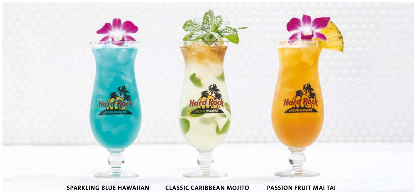
SPARKLING BLUE HAWAIIAN