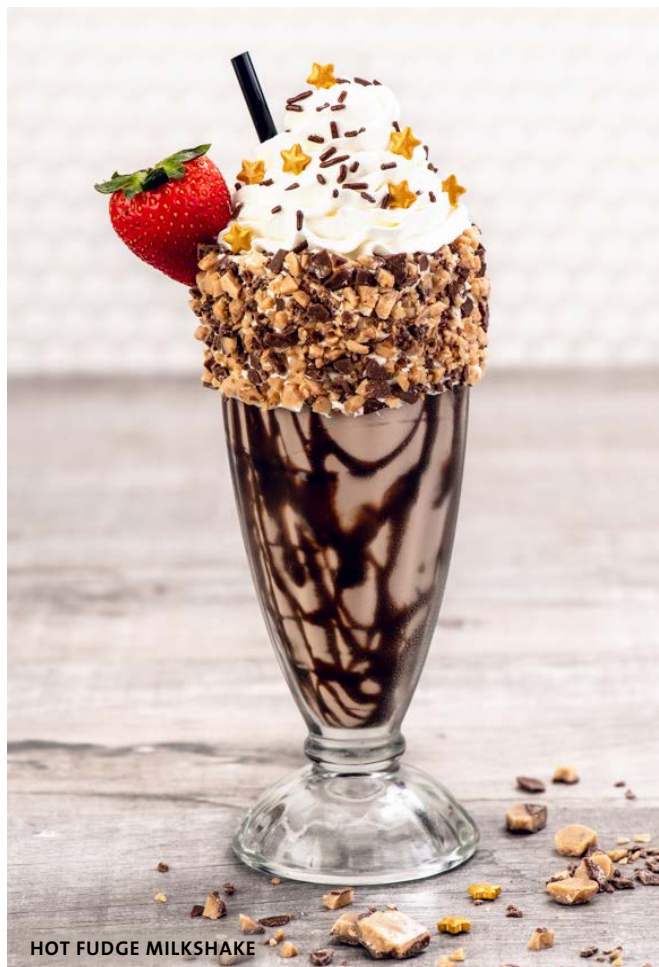
HOT FUDGE MILKSHAKE

Non-Alcoholic version, served in a signature mini-milk jug