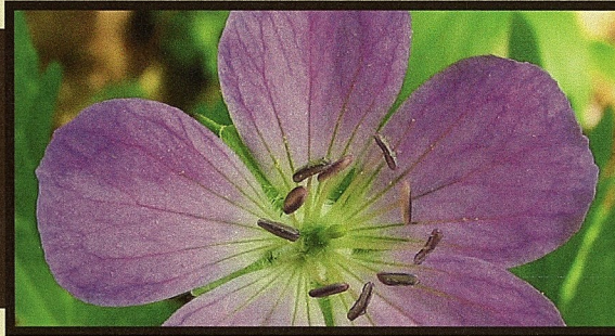
Wild Geranium Geranium maculatum

Look for these wildflowers on the trails!