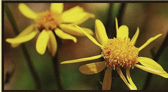
Golden Ragwort Senecio aureus