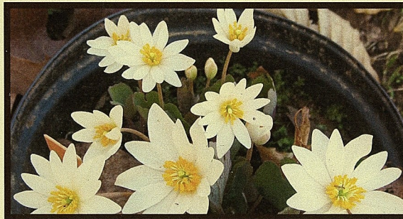
Bloodroot Sanguinaria canadensis