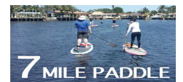
7 Mile Paddle