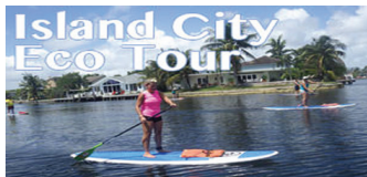
Island City Eco Tour