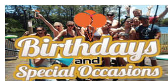
Birthdays & Special Occasions