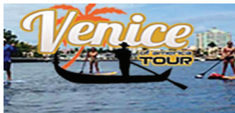
Venice of America Tour