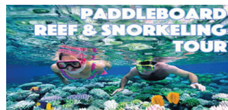
Reef & Snorkel Tour