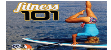
Paddle Board Fitness