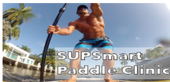
SUPSmart Paddle Clinic