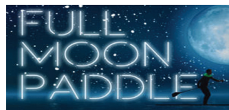
Full Moon Paddle