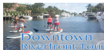
Downtown Riverfront Tour