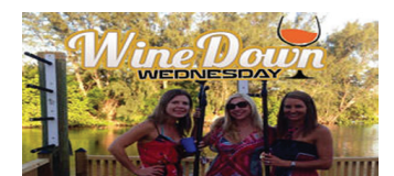
Wine Down Wednesdays

SAVE $25 OFF ANY TOUR or ALL-DAY RENTALS At Fort Lauderdale's Paddle Board Headquarters.