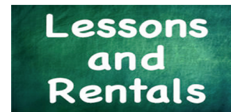
Full Moon Paddle