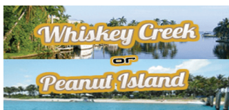
Whiskey Creek or Peanut Island