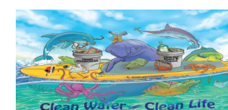
Clean River Project