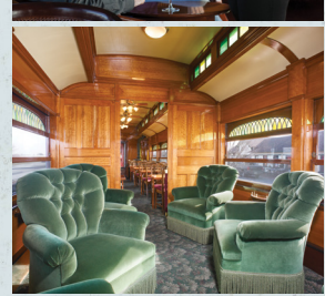
FIRST-CLASS & DINING OPTIONS AVAILARLE

Not sure what to expect? Visit SRRtips.com for FAQs