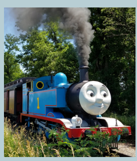
Day Out With Thomas™

See the world-famous Amish Country in a unique way at America's oldest operating railroad! Tucked in the heart of beautiful Lancaster County and operating since 1832, history comes alive on your fully-narrated, 45-minute excursion steam train ride through 1,000 acres of picturesque countryside.