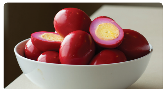
Red Beet Eggs

Applesauce Cucumber & Onions Baby Lima Beans French Fries Baked Lima Beans Jello Salad Baked Potato Macaroni & Cheese Bread Filling Macaroni Salad Buttered Noodles Pepper Cabbage Candied Sweet Potatoes Pickled Beets Carrots Real Mashed Potatoes Carrot Salad Red Beet Eggs Chow Chow Stewed Tomatoes Cole Slaw Sugar Free Jello Corn Tossed Salad Cottage Cheese Wild Rice