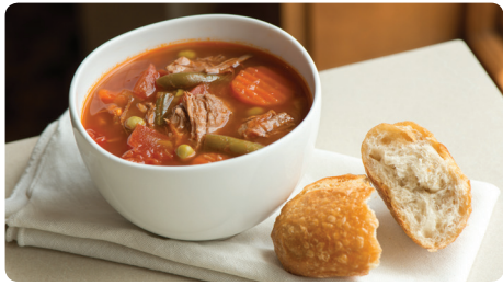
Vegetable Beef Soup