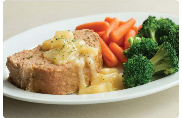
Baked Ham Loaf

Locally grown, farm-fresh turkey, roasted in our kitchen and served with filling and gravy 12.29 Small portion 11.29