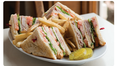
Blue Jay Club

Sliced fresh roast turkey, crisp bacon, lettuce, tomato and mayonnaise 9.85