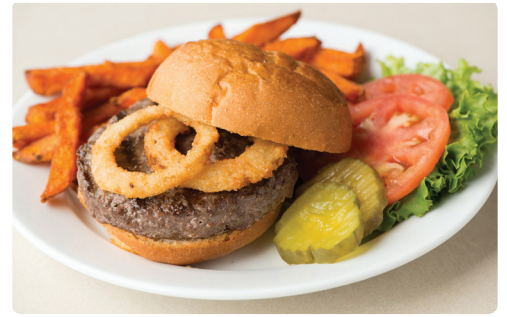
Smucker Angus Burger

Charbroiled 6 oz. burger, made with Angus beef raised on John Smucker's farm, cooked to medium (touch of pink) or well done, topped with onion straws and served with sweet potato fries 8.99