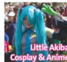
Little Akiba Cosplay & Anime