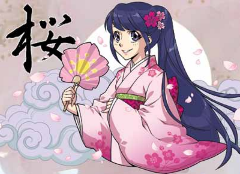
Momoka Harumi, official mascot of the Subaru Cherry Blossom Festival

As a 501(c)(3) non-profit, JASGP is a member supported organization. To become a member, to get involved, or for more information, visit japanphilly.org .