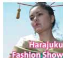
Harajuku Fashion Show