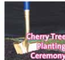
Cherry Tree Planting Ceremony