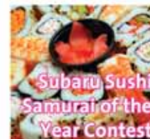
Subaru Sushi Samurai of the Year Contest