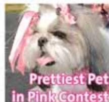
Prettiest Pet in Pink Contest