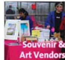
Souvenir & Art Vendors