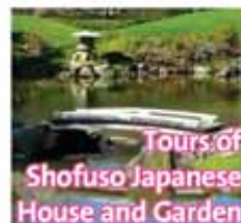
Tours of Shofuso Japanese House and Garden