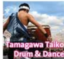
Tamagawa Taiko Drum & Dance

Visit subarucherryblossom.org for detailed information on getting to Sakura Sunday.