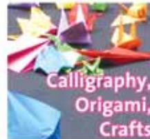
Calligraphy, Origami, Crafts