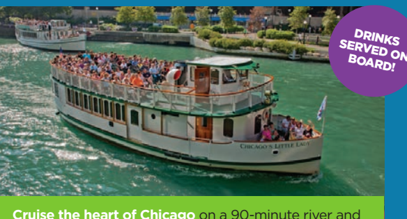
Cruise the heart of Chicago on a 90-minute river and lake cruise offering daytime and evening departures.