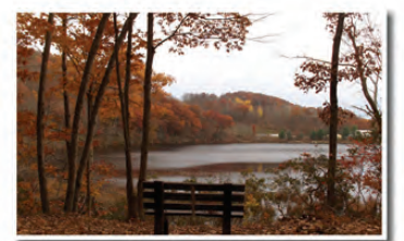
LANTERN HILL POND

ENJOY THE VIEW FROM LANTERN HILL Follow a steep climbing trail and be rewarded with a beautiful view. Lantern Hill has been referenced back to 1653, suggesting its importance as a signaling or gathering place first to Native People, later to the English. There is also archaeological evidence indicating the presence of Native People as far back as 10,000 years ago. Elevation: 491' above sea level.