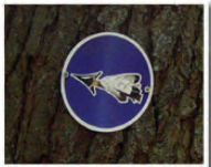
MUSEUM TRAIL MARKER

Rhododendron flowers bloom in July. Local tradition states that the red hearts of these flowers symbolize Pequot blood shed during the Pequot Massacre of 1637.