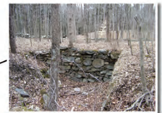
STONE FOUNDATION Foundation remains of a 1800s sawmill