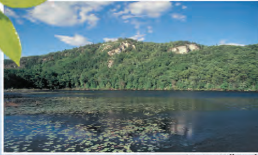
Lantern Hill Pond