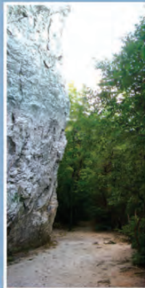
Lantern Hill Trail