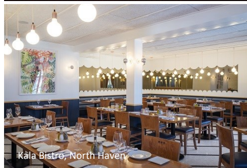
Kala Bistro, North Haven

Lenny & Joe's Fish Tale | Seafood Awarded best seafood from the Shoreline Times and Connecticut Magazine. 1301 Boston Post Rd., Madison 203-245-7289 | ljfishtale.com