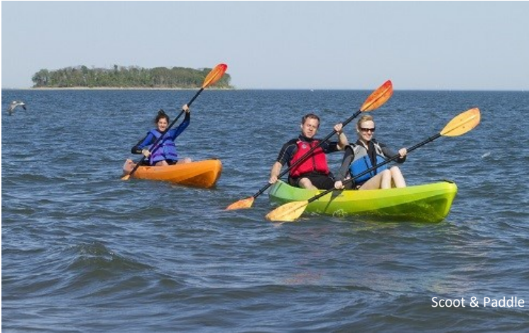
Scoot & Paddle

Kayak: Scoot & Paddle , Milford. Kayak, stand-up paddleboard, and motorized scooter rentals. Lessons and group tours available. Fees vary. Monday-Thursday 9 a.m.-6 p.m.; Friday 9 a.m.-7 p.m.; Saturday & Sunday 8 a.m.-7 p.m. Please call for off-peak season hours. scootandpaddle.com | 203-713-8282