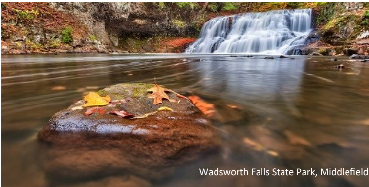
Wadsworth Falls State Park, Middlefield

Wadsworth Falls State Park , Rte. 157, Middlefield. Picnicking, fishing, hiking, swimming. Beautiful waterfall and colorful mountain laurel in springtime. The swimming pool, a saucer-shaped basin hollowed out of the level plain south of Rte. 157, is paved with a soil cement to prevent water from leaching out. Water pumped from a series of inter-connected wells located near the river is directed into the pool creating a circulating effect. Weekends and holiday parking fees: $15 out-of-state vehicles. Weekdays: $10 out-of-state vehicles. portal.ct.gov/DEEP | 860-345-8521