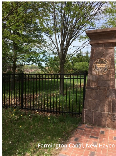
Farmington Canal, New Haven

Farmington Canal Linear Park , New Haven/ Hamden/ Cheshire. 14 scenic miles (and growing) walkway perfect for biking, walking, hiking and in-line skating, beginning in Hamden and continuing north into Cheshire and south into New Haven. Parking available on Todd St., Sherman Ave., Brooksvale Park and Connolly Pkwy., all in Hamden, as well as near Lock 12 in Cheshire. Dawn to dusk. farmingtoncanal.org | 203-287-5658