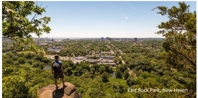
East Rock Park, New Haven