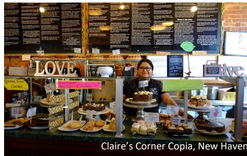
Claire's Corner Copia, New Haven

Claire's Corner Copia | Vegetarian 1000 Chapel St., New Haven 203-562-3888 clairescornercopia.com