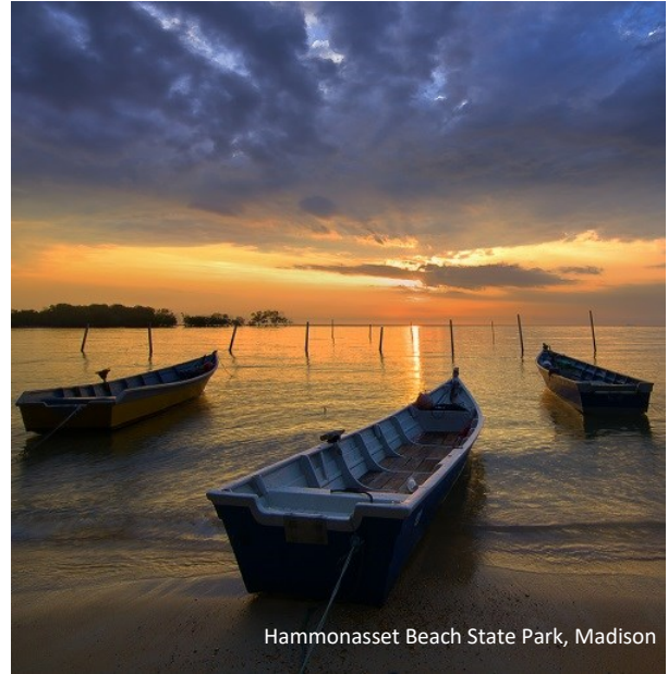
Hammonasset Beach State Park, Madison