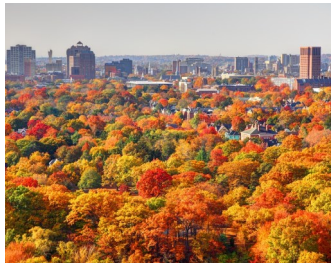
Downtown New Haven