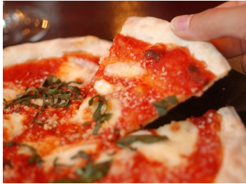
New Haven Style Pizza