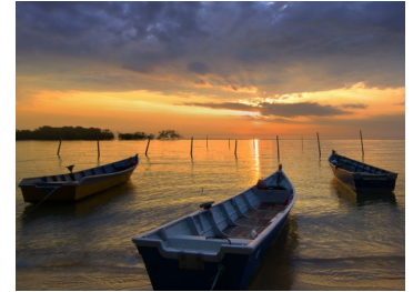
Madison, CT Shoreline