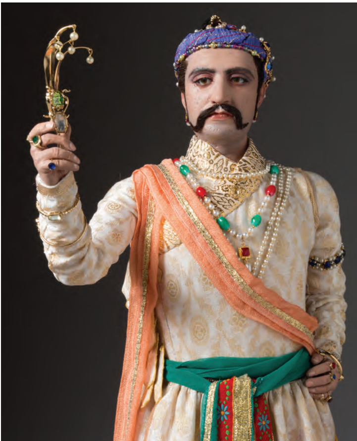
The Shah Jahan holds the turban ornament containing the Great Table Cut diamond. Taken as plunder by an Iranian Mogul, the diamond disappeared, although there is some evidence it still exists.