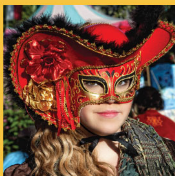
Wonders of the World Sept. 5, 6 & 7