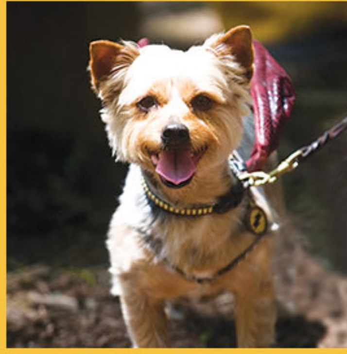
Pet Fest Sept. 19 & 20