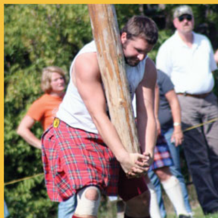
Highland Fling Sept. 12 & 13