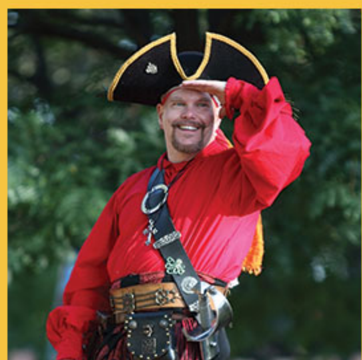
Pirates Ale Fest Oct. 17 & 18