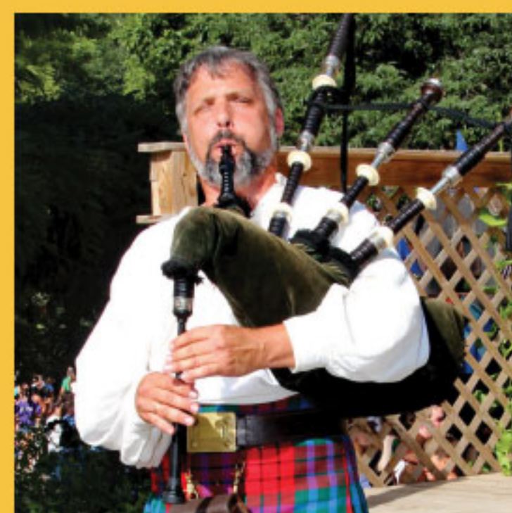
Shamrocks & Shenanigans Sept. 26 & 27