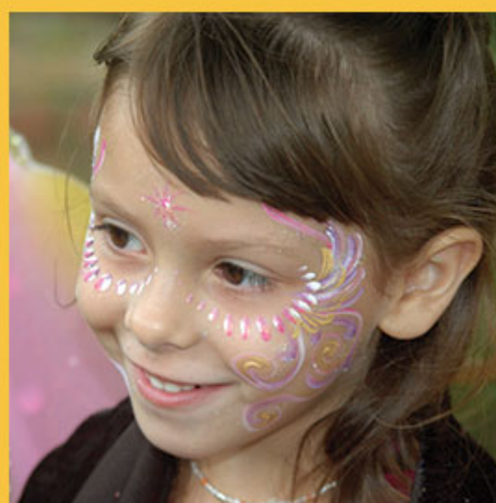
Harvest Huzzah Oct. 12