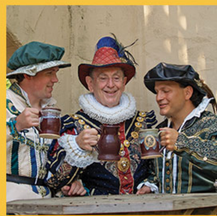
Oktoberfest Oct. 10 & 11