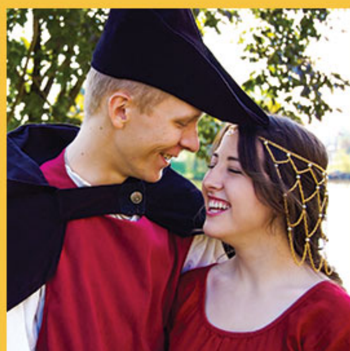
Wine, Chocolate & Romance Oct. 3 & 4