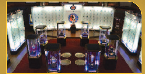
Honoured Member Plaques and NHL Trophies

Get up close and personal with the Stanley Cup on display in the spectacular Esso Great Hall. No visit is complete until you've had your photo taken with hockey's Holy Grail!