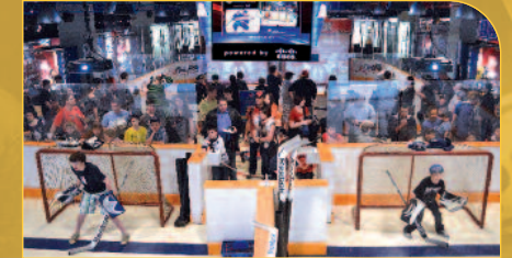
NHLPA Game Time