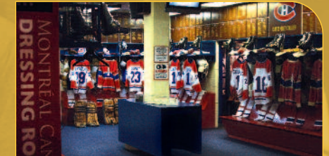
Replica Montreal Canadiens Dressing Room