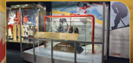
2010 Olympic 'Golden Goal' Display