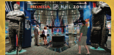
Honda NHL Zone