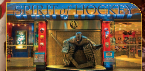
Hockey's #1 Gift Store in Toronto