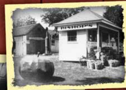
Original Bishop's Farmstand (circa 1920).

Since 1871, six generations of Bishop's have been serving Connecticut with the best possible farm products. In an area steeped in history and tradition, Bishop's Orchards Farm Market is boldly woven into the tapestry of this remarkable New England town. Bishop's is situated in the historic shoreline town of Guilford. With majestic views of Long Island Sound, Guilford also boasts the largest town Green in New England (over 7 acres) surrounded by historic homes, churches and shops. The Henry Whitfield State Museum, built in 1639, is the oldest Stone House in Connecticut (our Stone House White Wine namesake) and is the perfect destination to be included in your trip to Bishop's Orchards.