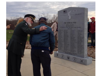
Korean War Memorial at the Missouri State Veterans Cemetery.

Commemorative monument welcoming visitors and new residents to St. Robert and honoring the branches of the United States Military.