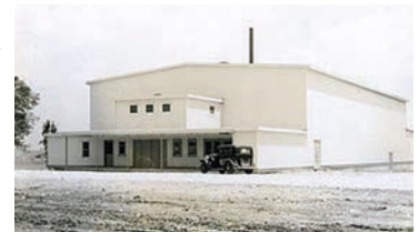
Nutter Field House