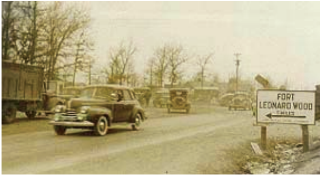
Historic Rt 66 & Missouri Ave. (Fort Wood Spur)

12.4 (18.8) The legs of the water tower you see to your right in the distance point to the three rivers in Pulaski County. Big Piney to the South, Gasconade to the North, and the Roubidoux River to the West.