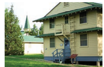
WWII Mobilization Area

4.8 Memorial Grove and Park is located to the left, behind the WWII Area. The stones and plaque honor soldiers and units of the three Army branches. The Chemical and Military Police Corps memorials were moved to Fort Leonard Wood from Fort McClellan, Alabama,