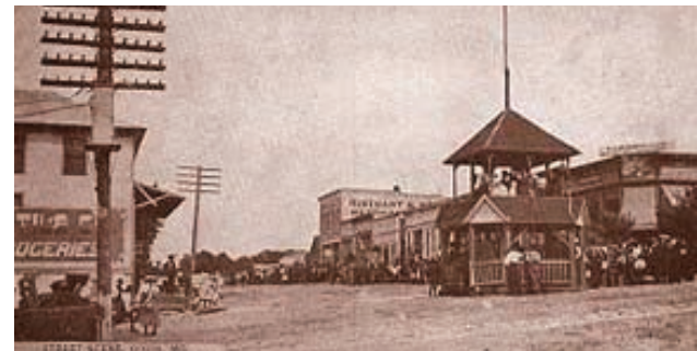
Dixon, MO — 2nd & Elm

25.3 A Frisco caboose is in Frisco Park along the railroad track on left. One block