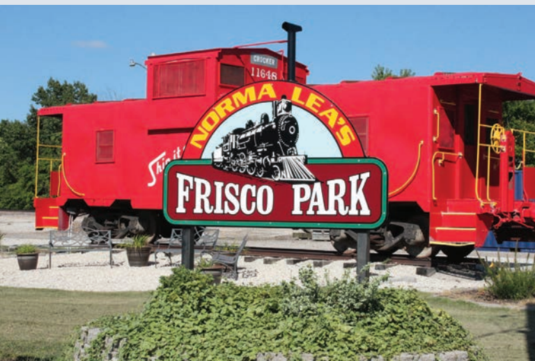
Crocker, MO — Frisco Park

The trains still rumble through the Frisco towns. The Frisco merged with the Burlington Northern in 1980.