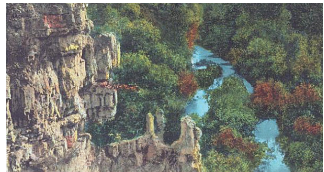
Portuguese Point — Dixon, MO

6.7 At the restaurant (left) located at Portuguese Point, enjoy this beautiful scenic overlook of bluffs and the Gasconade River. You might even spot an eagle! This area was named after an Indian who owned the land in the 1800s. In those days he didn’t want people to know his heritage, so he told them he was of Portuguese descent.