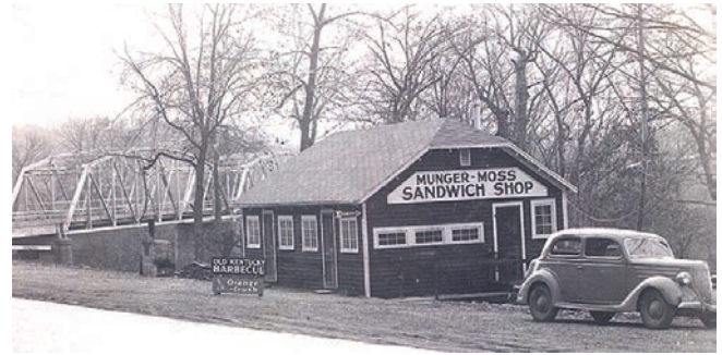
Munger-Moss Sandwich Shop

8.9 (24.3) Left onto the original “new” Route 66 pavement. This is some of the best 1943 curbed pavement in the state. The half curb was designed to keep autos on the road but, often as not, would tip them over. This area is called Grandview.