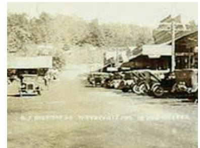
Historic Rt 66, Waynesville