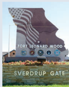
Fort Leonard Wood Main Gate

2.2 At the intersection of Missouri Ave. and North Dakota Ave. is the Joint Services Park which was established in honor of all branches of the military that train on Fort Leonard Wood. Continue through the intersection. Turn left, parking is