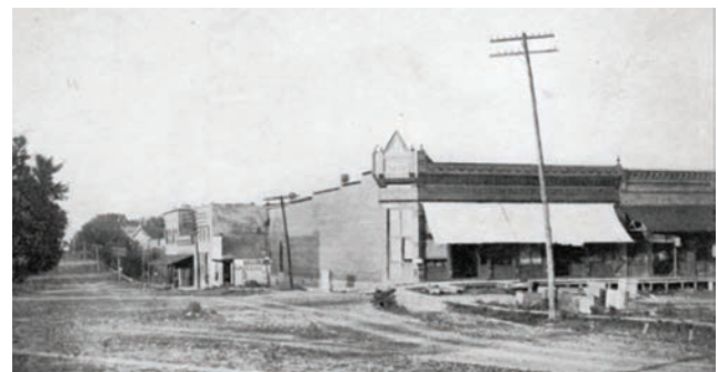
Intersection of Pine & McClurg – Richland, MO

45.1 Intersection with I-44. County Road AB. Across the overpass is Historic Route 66 by Gascozark (page 4)