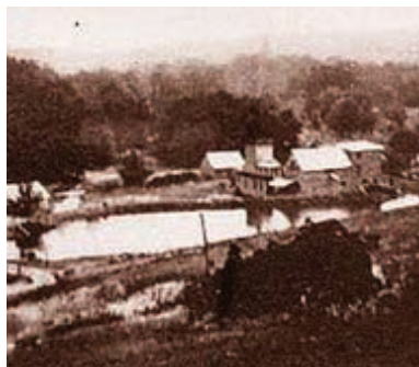
Schlicht Springs – Crocker, MO

in the early part of the century with sportsmen from St. Louis taking the train to Crocker and then traveling by hack (wagon) to the resort. Nearby is the site of another popular resort on the Gasconade, Cave Lodge. (The drive to Schlicht Springs is an additional 3.6 miles. Cross