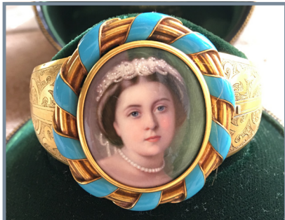
Bracelet with Portrait of Queen Victoria's eldest daughter, Victoria Adelaide Mary Louisa, Princess Royal.

The Lockwood-Mathews Mansion Museum will launch a Scavenger Hunt throughout Mathews Park in collaboration with the Center for Contemporary Printmaking and Stepping Stones Museum for Children. Participants will search for some of the most mysterious symbols, architectural details, objects, and history on the exterior facades of all three buildings and inside the Mansion. Visitors will need to bring their A-Game and power of observation to win the top prize! Children must be accompanied by an adult or legal guardian. For tickets and additional guidelines please visit www.lockwoodmathewsmansion.com .