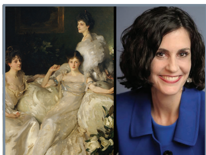
Left: John Singer Sargent, The Wyndham Sisters: Lady Elcho, Mrs. Adeane, and Mrs. Tennant , 1899. The Metropolitan Museum of Art.