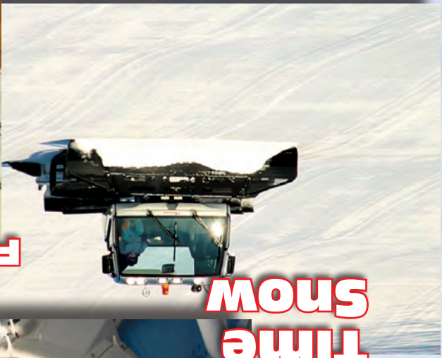
Big Time Snow