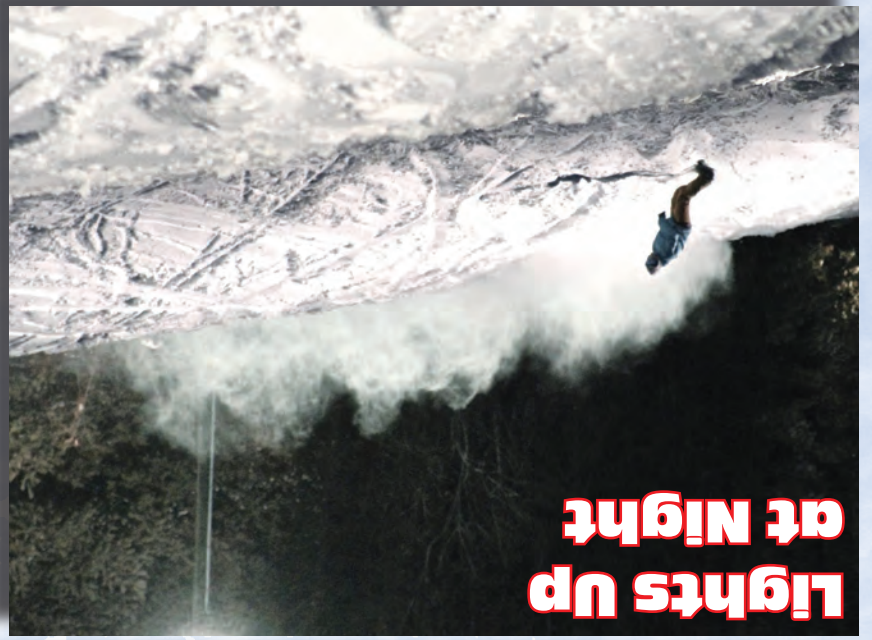
Lights Up at Night