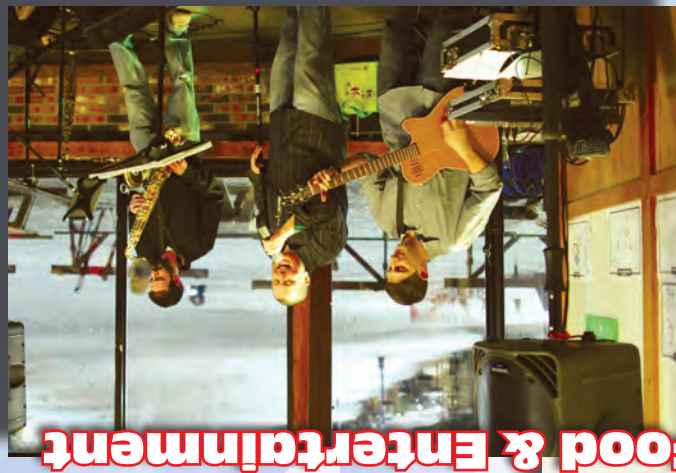
Food & Entertainment