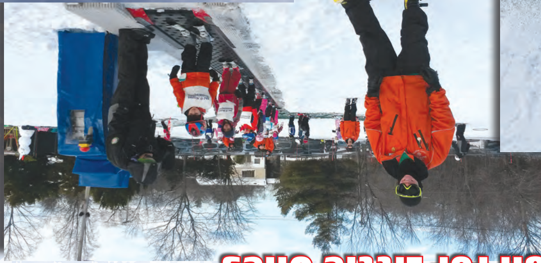
Fun for Little Ones