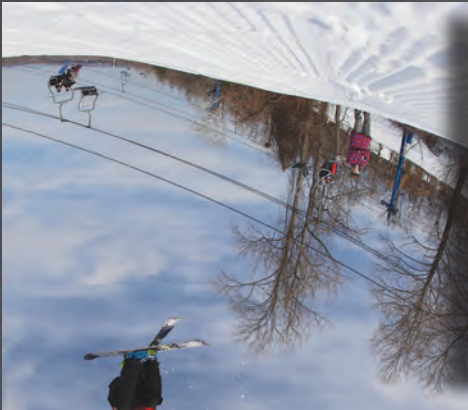
Terrain For All