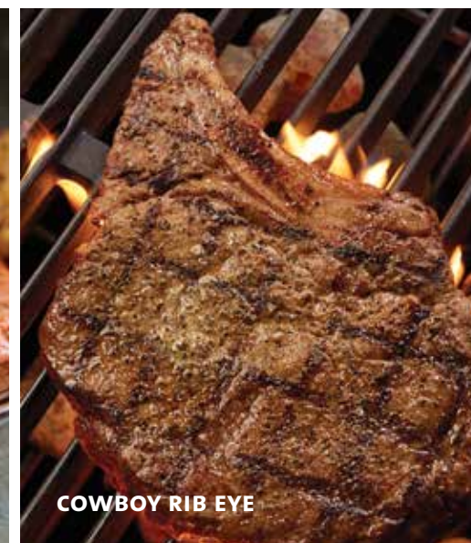
COWBOY RIB EYE