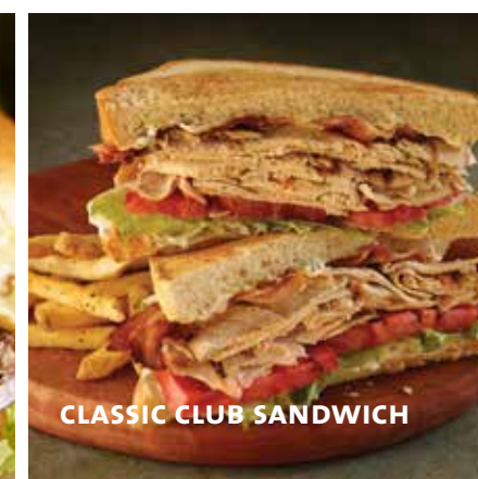
CLASSIC CLUB SANDWICH