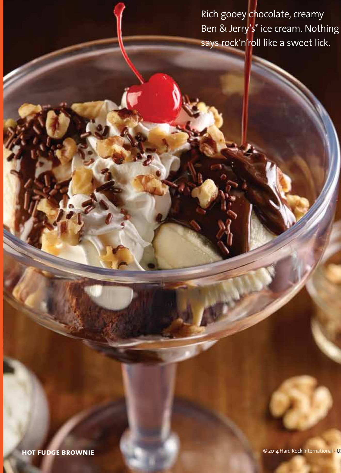
HOT FUDGE BROWNIE

Rich gooey chocolate, creamy Ben & Jerry's® ice cream. Nothing says rock'n'roll like a sweet lick.