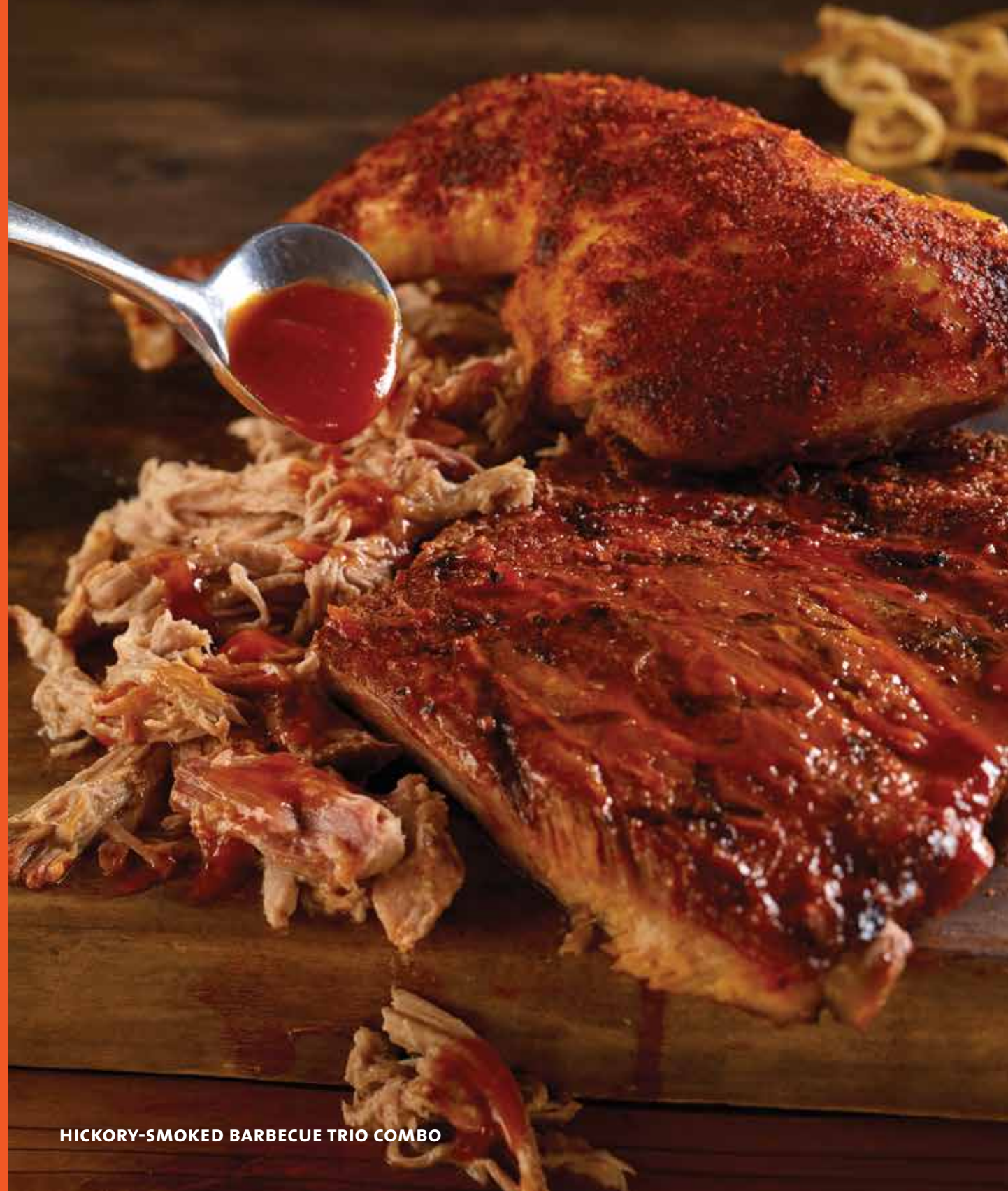
HICKORY-SMOKED BARBECUE TRIO COMBO