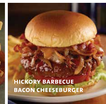
HICKORY BARBECUE BACON CHEESEBURGER