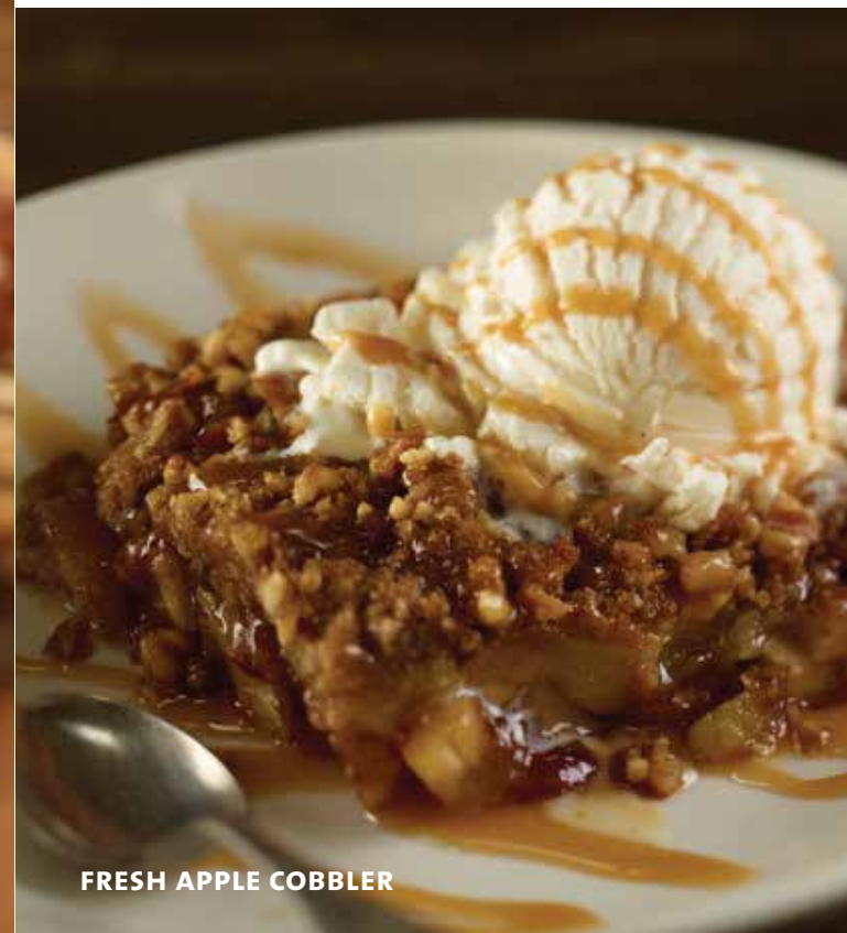
FRESH APPLE COBBLER