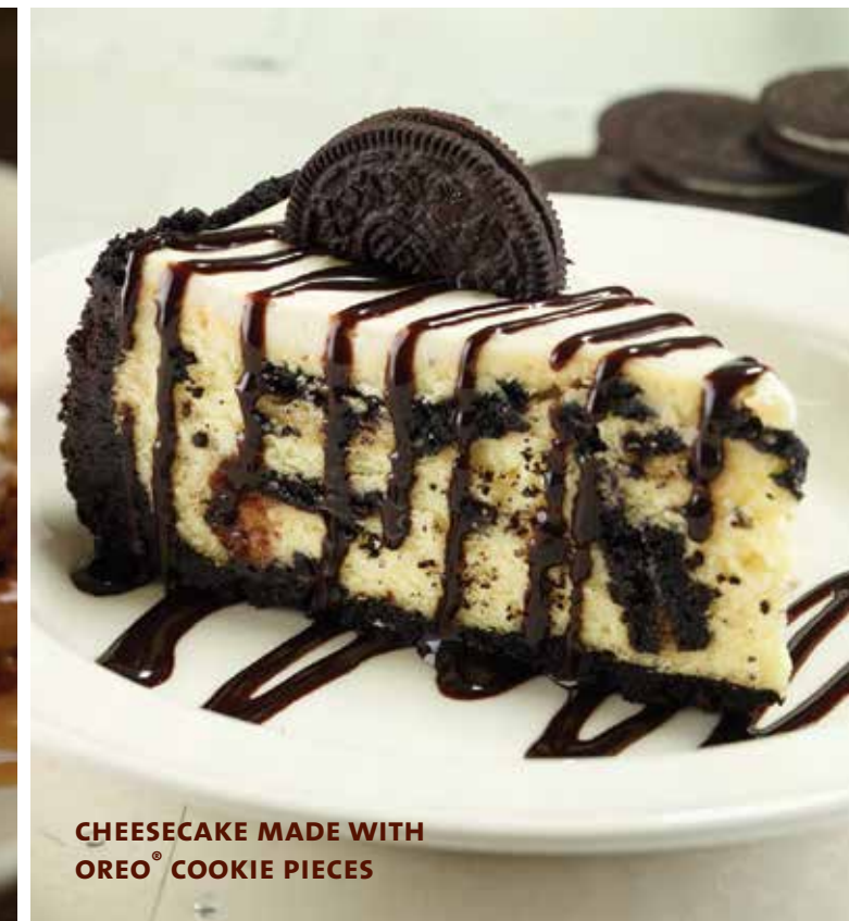
CHEESECAKE MADE WITH OREO® COOKIE PIECES