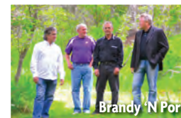
Brandy 'N Port