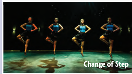
Change of Step