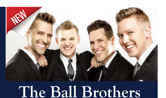
Thursday, August 23 Doors Open 5:30 PM Dinner 6:00 PM | Concert 7:00 PM $42.00