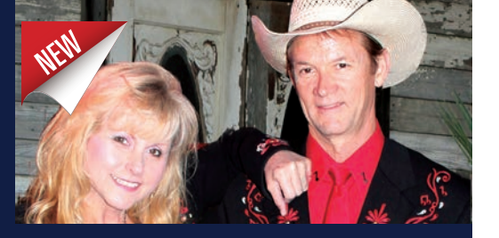
Saturday, August 11 Doors Open 5:30 PM Dinner 6:00 PM | Concert 7:00 PM $45.00