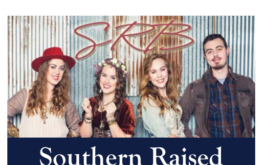
Thursday, October 11 Doors Open 5:30 PM Dinner 6:00 PM | Concert 7:00 PM $40.00