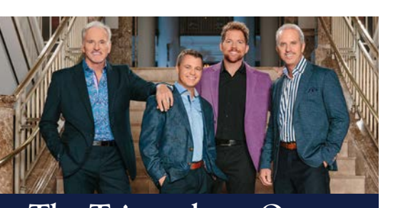
The Triumphant Quartet Thursday, September 6 Doors Open 5:30 PM Dinner 6:00 PM | Concert 7:00 PM $45.00