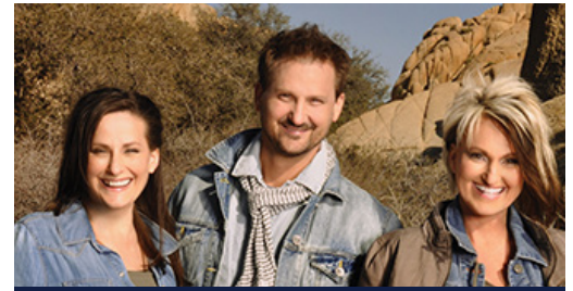
The Martins Thursday, September 20 Doors Open 5:30 PM Dinner 6:00 PM | Concert 7:00 PM $49.00