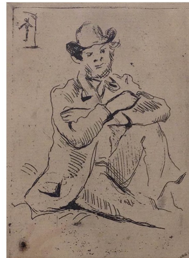
Paul Cezanne, Guillaumin au pendu , 1873 Samuel E. Weir Collection, RiverBrink Art Museum

The exploration of the work of individual members of the Group of Seven continues with the work of Franz Johnston (1888-1949). Johnston gained notoriety as the first member of the Group to resign, but his affinity for wilderness landscapes remained strong. The imposing oil Belle River provides ample evidence of the lingering appeal of the landscapes of northern Ontario and Quebec.