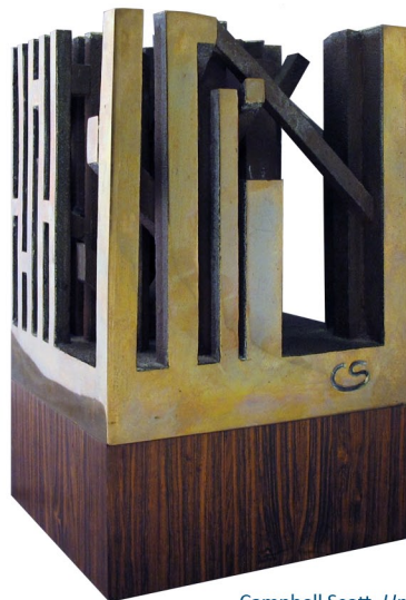
Campbell Scott, Untitled , c. 1970