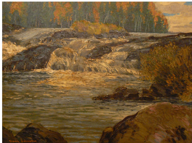
Franz Johnston, Belle River , n.d., Samuel E. Weir Collection, RiverBrink Art Museum